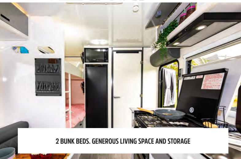
2 BUNK BEDS. GENEROUS LIVING SPACE AND STORAGE