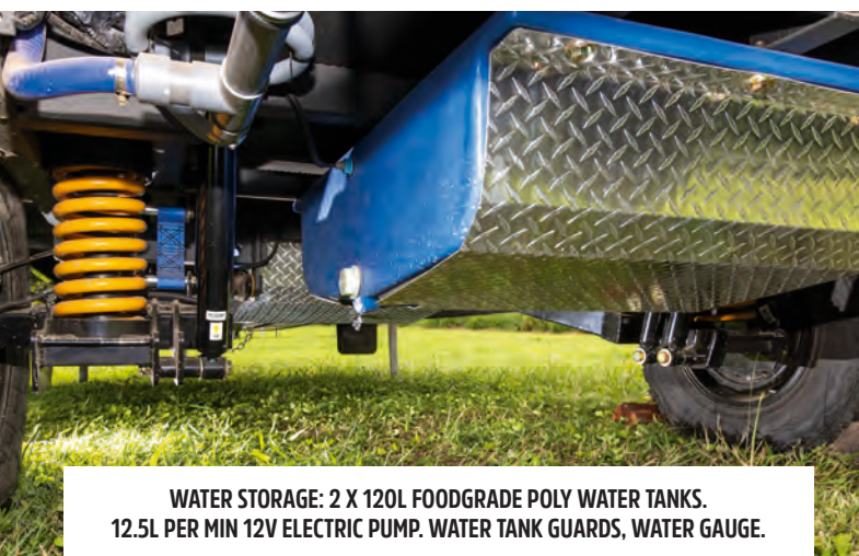
WATER STORAGE: 2 X 120L FOODGRADE POLY WATER TANKS. 12.5L PER MIN 12V ELECTRIC PUMP. WATER TANK GUARDS, WATER GAUGE.