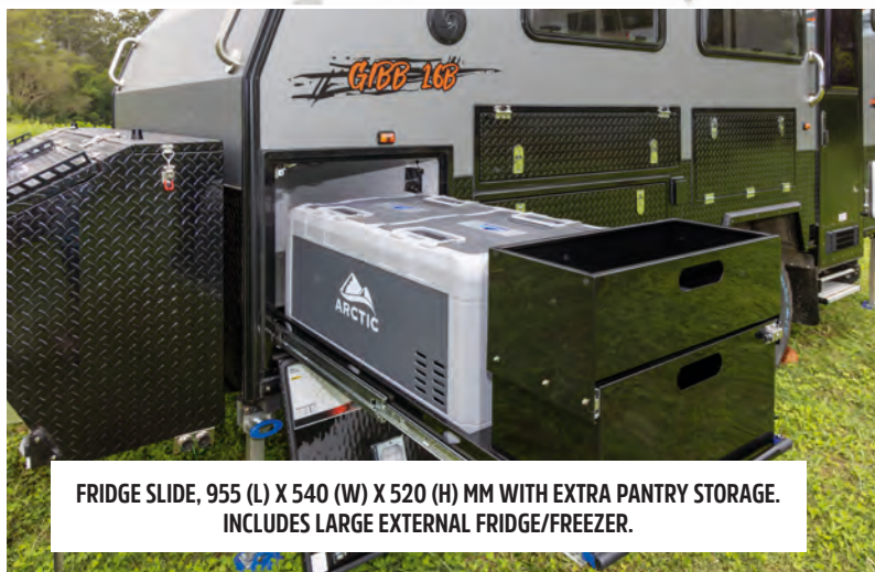
FRIDGE SLIDE, 955 (L) X 540 (W) X 520 (H) MM WITH EXTRA PANTRY STORAGE. INCLUDES LARGE EXTERNAL FRIDGE/FREEZER.