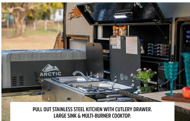
PULL OUT STAINLESS STEEL KITCHEN WITH CUTLERY DRAWER. LARGE SINK & MULTI-BURNER COOKTOP.