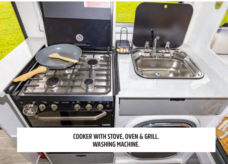
COOKER WITH STOVE, OVEN & GRILL. WASHING MACHINE.