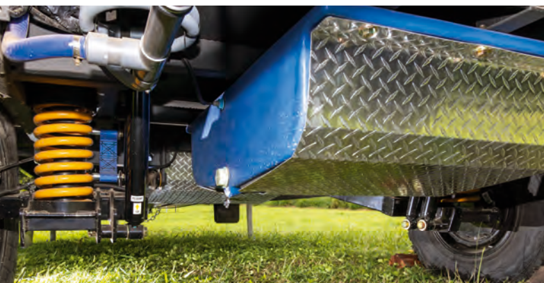
WATER STORAGE: 2 X 120L FOODGRADE POLY WATER TANKS. 12.5L PER MIN 12V ELECTRIC PUMP. WATER TANK GUARDS, WATER GAUGE.