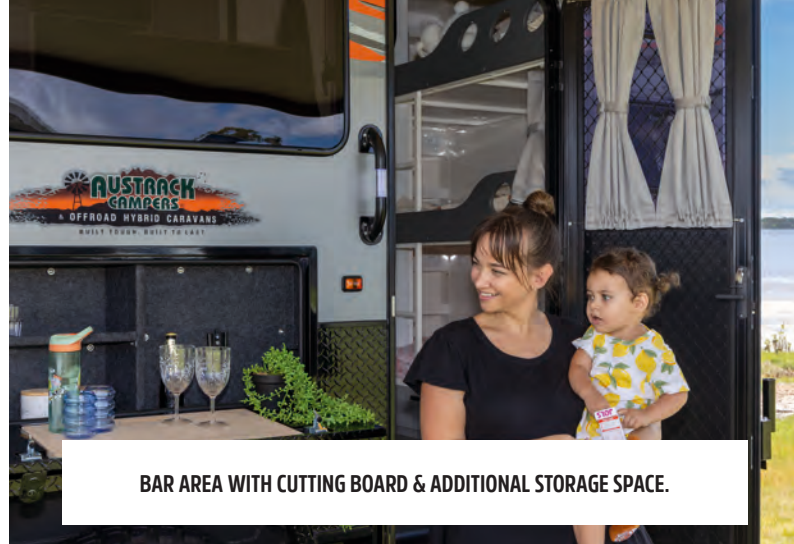
BAR AREA WITH CUTTING BOARD & ADDITIONAL STORAGE SPACE.