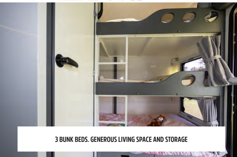
3 BUNK BEDS. GENEROUS LIVING SPACE AND STORAGE