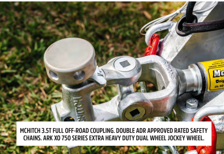
MCHITCH 3.5T FULL OFF-ROAD COUPLING. DOUBLE ADR APPROVED RATED SAFETY CHAINS. ARK XO 750 SERIES EXTRA HEAVY DUTY DUAL WHEEL JOCKEY WHEEL.