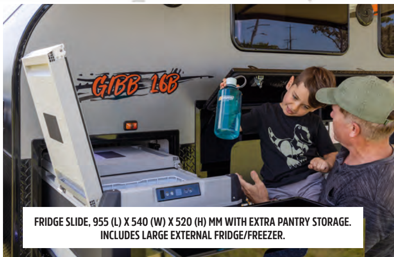
FRIDGE SLIDE, 955 (L) X 540 (W) X 520 (H) MM WITH EXTRA PANTRY STORAGE. INCLUDES LARGE EXTERNAL FRIDGE/FREEZER.