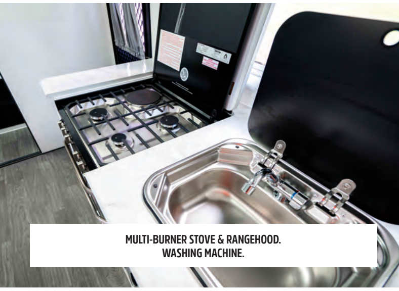
MULTI-BURNER STOVE & RANGEHOOD. WASHING MACHINE.