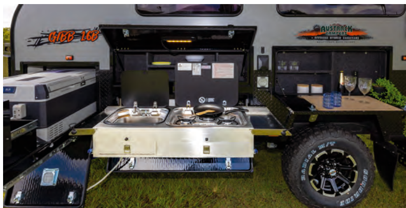
PULL OUT STAINLESS STEEL KITCHEN WITH CUTLERY DRAWER. LARGE SINK & MULTI-BURNER COOKTOP.