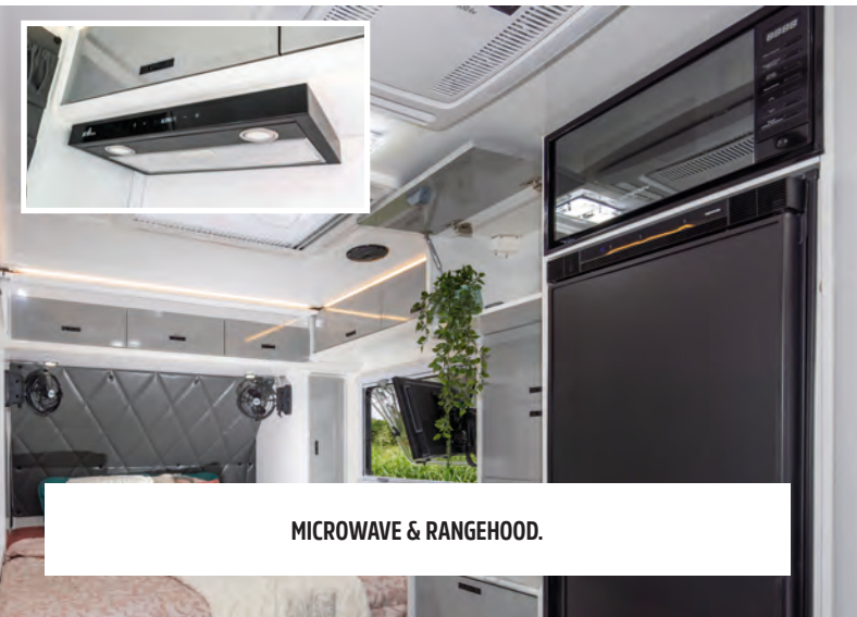
MICROWAVE & RANGEHOOD.