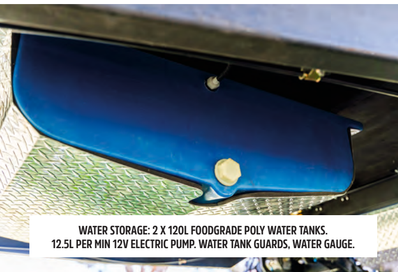
WATER STORAGE: 2 X 120L FOODGRADE POLY WATER TANKS. 12.5L PER MIN 12V ELECTRIC PUMP. WATER TANK GUARDS, WATER GAUGE.