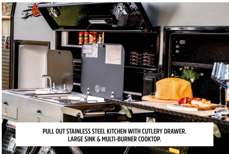
PULL OUT STAINLESS STEEL KITCHEN WITH CUTLERY DRAWER. LARGE SINK & MULTI-BURNER COOKTOP.