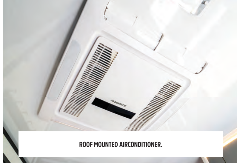
ROOF MOUNTED AIRCONDITIONER.