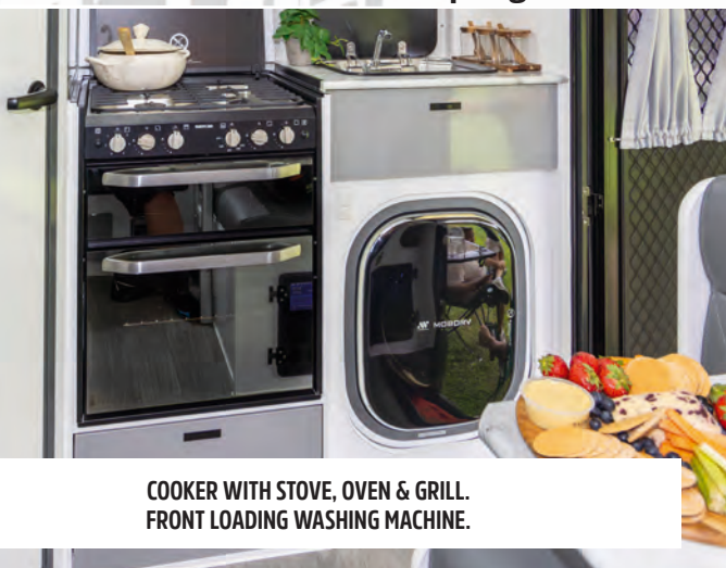
COOKER WITH STOVE, OVEN & GRILL. FRONT LOADING WASHING MACHINE.