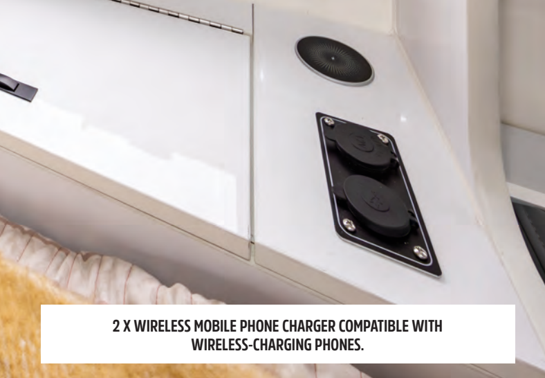
2 X WIRELESS MOBILE PHONE CHARGER COMPATIBLE WITH WIRELESS-CHARGING PHONES.