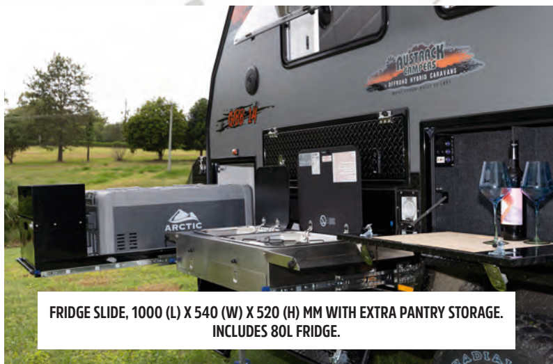
FRIDGE SLIDE, 1000 (L) X 540 (W) X 520 (H) MM WITH EXTRA PANTRY STORAGE. INCLUDES 80L FRIDGE.