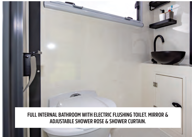
FULL INTERNAL BATHROOM WITH ELECTRIC FLUSHING TOILET. MIRROR & ADJUSTABLE SHOWER ROSE & SHOWER CURTAIN.