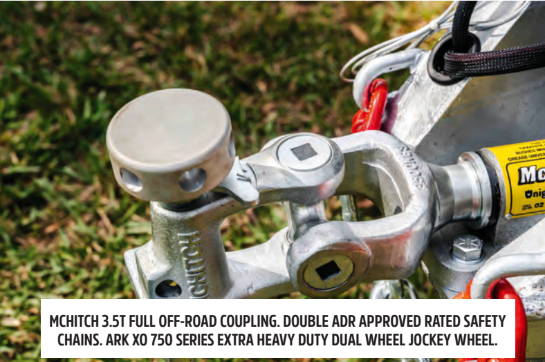
MCHITCH 3.5T FULL OFF-ROAD COUPLING. DOUBLE ADR APPROVED RATED SAFETY CHAINS. ARK X0 750 SERIES EXTRA HEAVY DUTY DUAL WHEEL JOCKEY WHEEL.