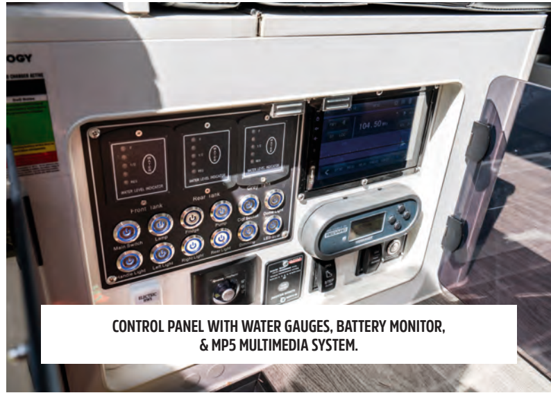
CONTROL PANEL WITH WATER GAUGES, BATTERY MONITOR, & MP5 MULTIMEDIA SYSTEM.