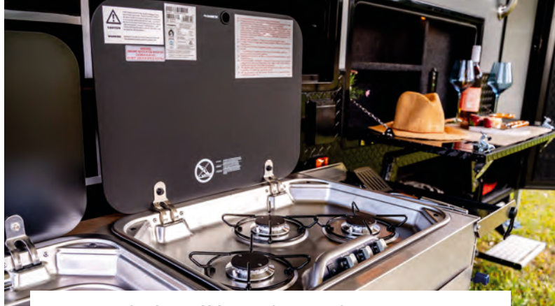
PULL OUT STAINLESS STEEL KITCHEN WITH CUTLERY DRAWER. LARGE SINK & MULTI-BURNER COOKTOP.