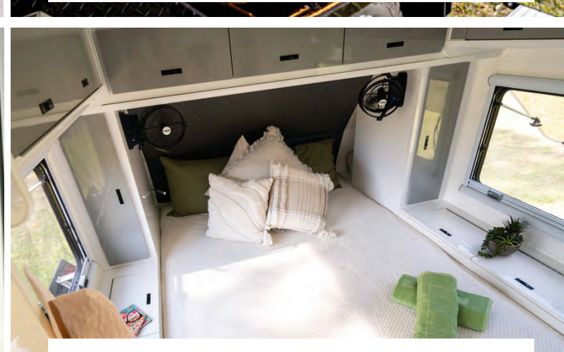
FULL INTERNAL BATHROOM WITH ELECTRIC FLUSHING TOILET. MIRROR & ADJUSTABLE SHOWER ROSE & SHOWER CURTAIN.