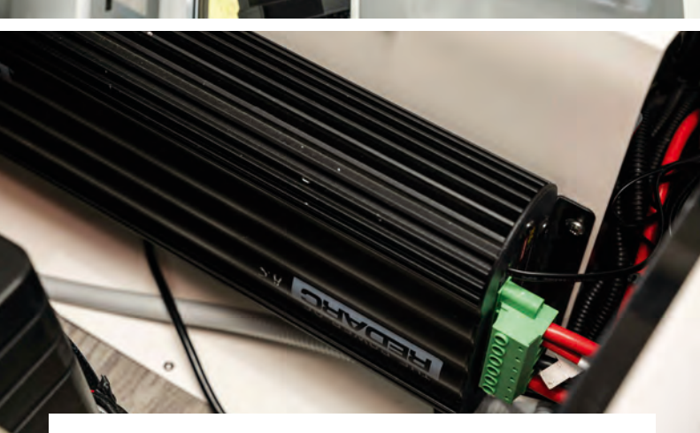
REDARC 2KW PURE SINEWAVE INVERTER WITH REMOTE SWITCH REDARC MANAGER30 COMPLETE BATTERY MANAGEMENT & CHARGING SYSTEM.