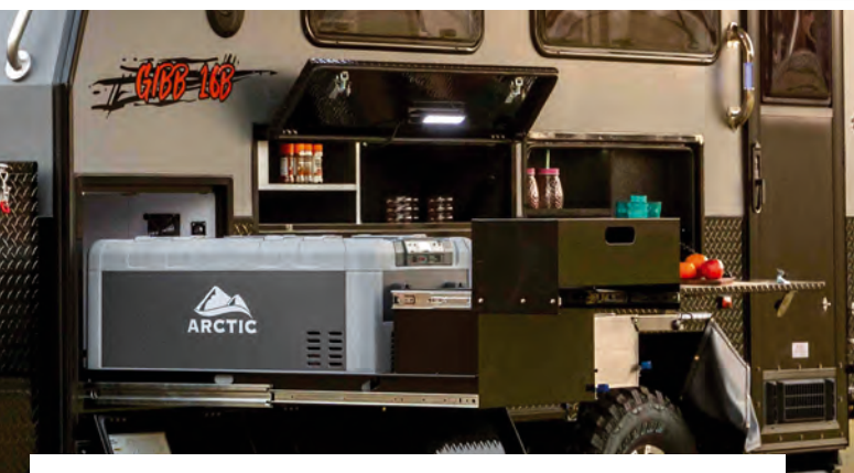
FRIDGE SLIDE, 1000 (L) X 540 (W) X 520 (H) MM WITH EXTRA PANTRY STORAGE. Includes 80L Fridge.