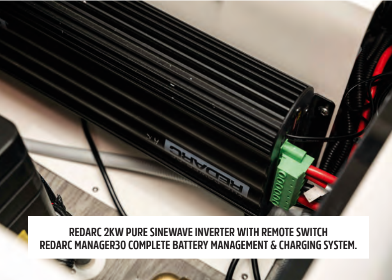
REDARC 2KW PURE SINEWAVE INVERTER WITH REMOTE SWITCH REDARC MANAGER30 COMPLETE BATTERY MANAGEMENT & CHARGING SYSTEM.