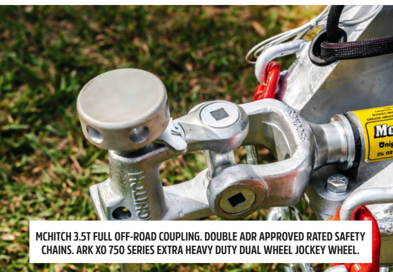
MCHITCH 3.5T FULL OFF-ROAD COUPLING. DOUBLE ADR APPROVED RATED SAFETY CHAINS. ARK X0 750 SERIES EXTRA HEAVY DUTY DUAL WHEEL JOCKEY WHEEL.