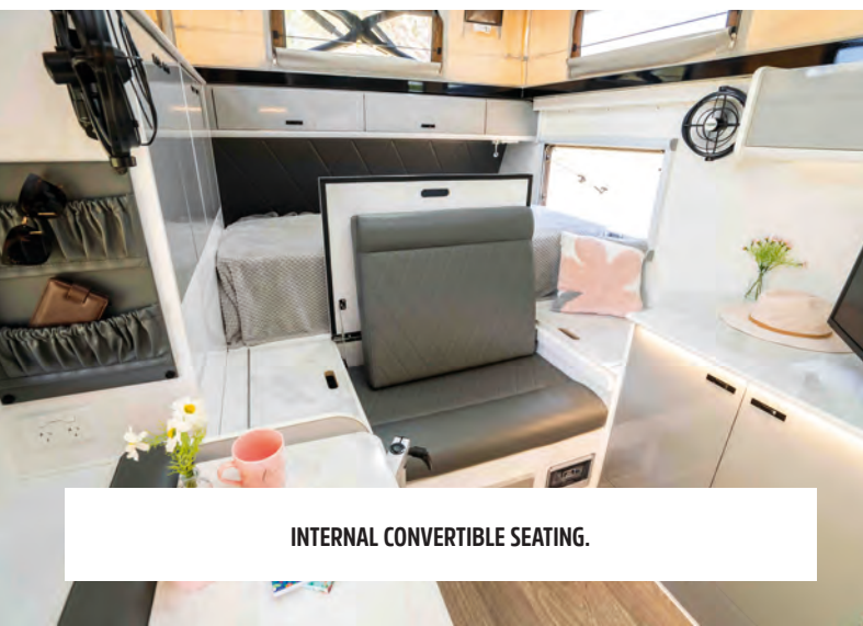
INTERNAL CONVERTIBLE SEATING.