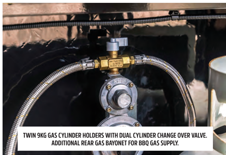
TWIN 9KG GAS CYLINDER HOLDERS WITH DUAL CYLINDER CHANGE OVER VALVE. ADDITIONAL REAR GAS BAYONET FOR BBQ GAS SUPPLY.