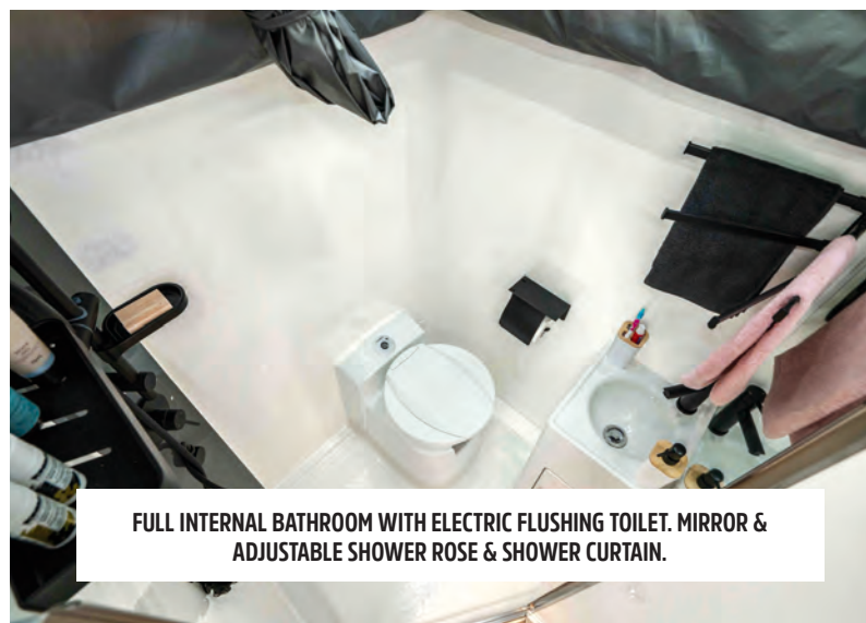
FULL INTERNAL BATHROOM WITH ELECTRIC FLUSHING TOILET. MIRROR & ADJUSTABLE SHOWER ROSE & SHOWER CURTAIN.