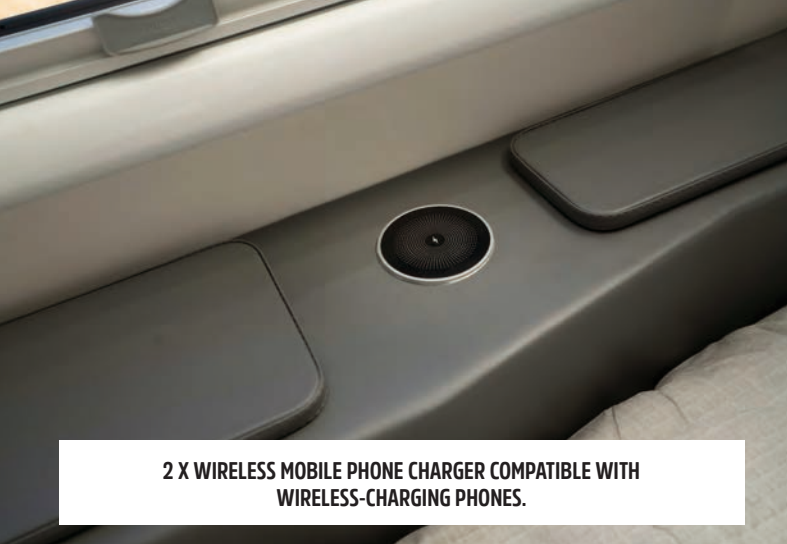
2 X WIRELESS MOBILE PHONE CHARGER COMPATIBLE WITH WIRELESS-CHARGING PHONES.