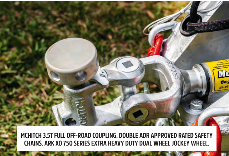
MCHITCH 3.5T FULL OFF-ROAD COUPLING. DOUBLE ADR APPROVED RATED SAFETY CHAINS. ARK X0 750 SERIES EXTRA HEAVY DUTY DUAL WHEEL JOCKEY WHEEL.