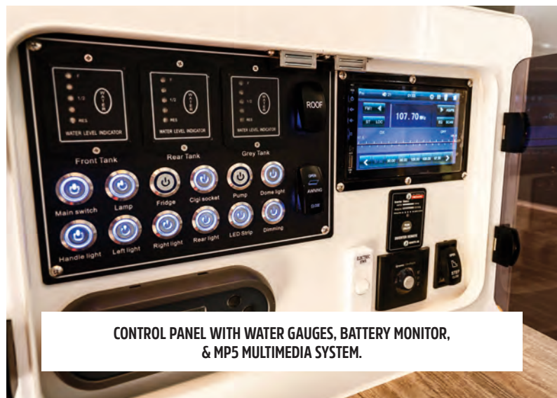
CONTROL PANEL WITH WATER GAUGES, BATTERY MONITOR, & MP5 MULTIMEDIA SYSTEM.