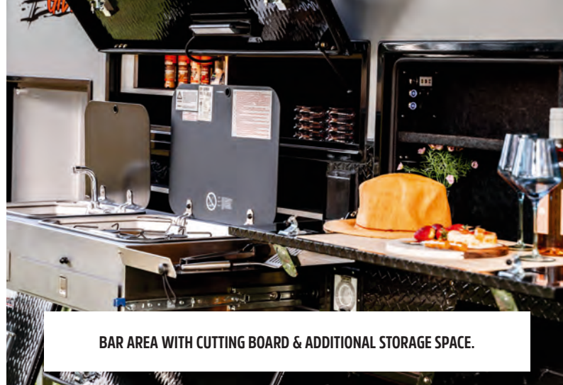
BAR AREA WITH CUTTING BOARD & ADDITIONAL STORAGE SPACE.