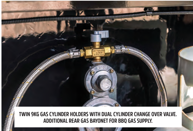
TWIN 9KG GAS CYLINDER HOLDERS WITH DUAL CYLINDER CHANGE OVER VALVE. ADDITIONAL REAR GAS BAYONET FOR BBQ GAS SUPPLY.