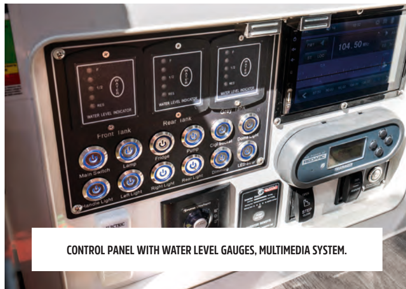
CONTROL PANEL WITH WATER LEVEL GAUGES, MULTIMEDIA SYSTEM.