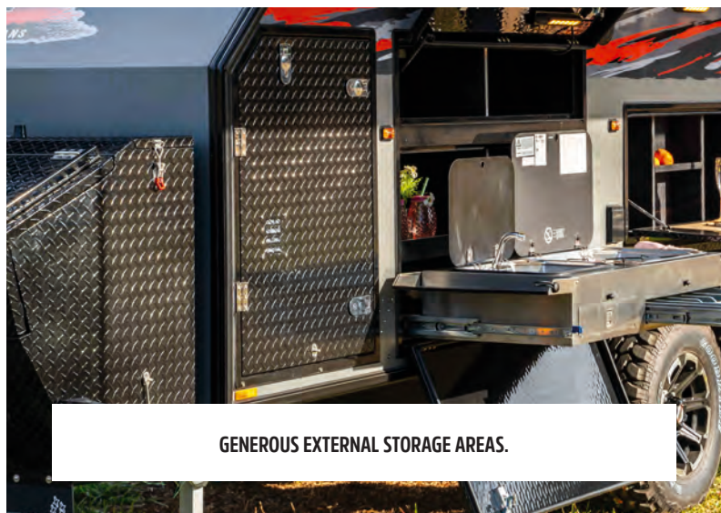
GENEROUS EXTERNAL STORAGE AREAS.