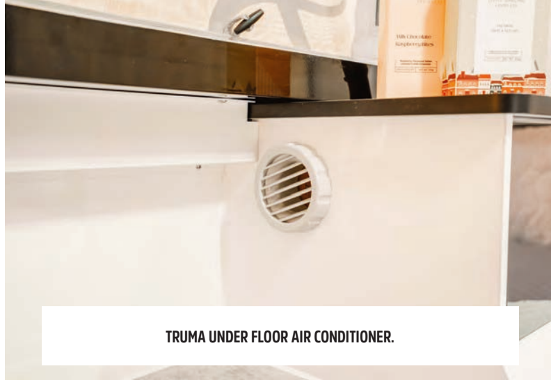
TRUMA UNDER FLOOR AIR CONDITIONER.