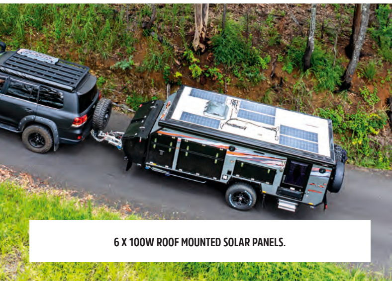
6 X 100W ROOF MOUNTED SOLAR PANELS.