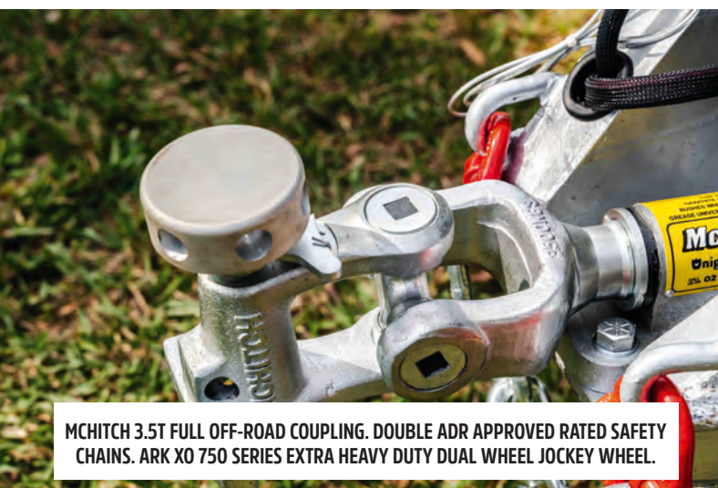
MCHITCH 3.5T FULL OFF-ROAD COUPLING. DOUBLE ADR APPROVED RATED SAFETY CHAINS. ARK X0 750 SERIES EXTRA HEAVY DUTY DUAL WHEEL JOCKEY WHEEL.