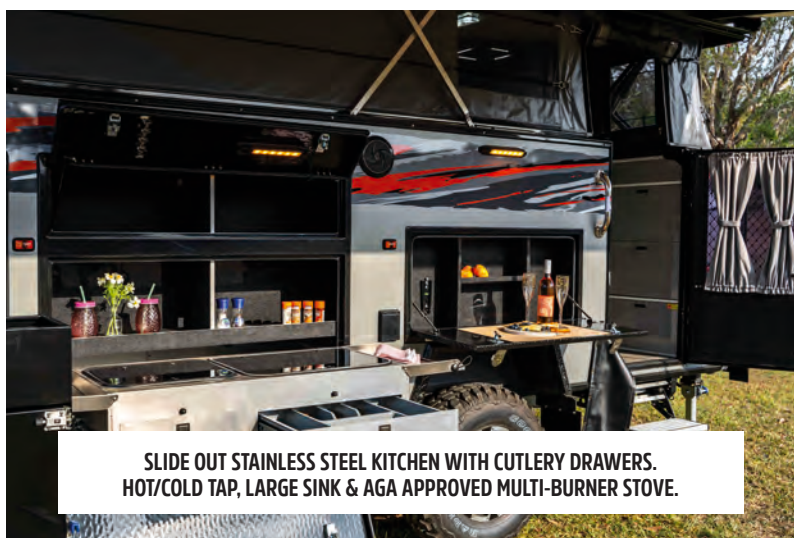
SLIDE OUT STAINLESS STEEL KITCHEN WITH CUTLERY DRAWERS. HOT/COLD TAP, LARGE SINK & AGA APPROVED MULTI-BURNER STOVE.