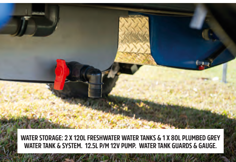
WATER STORAGE: 2 X 120L FRESHWATER WATER TANKS & 1 X 80L PLUMBED GREY WATER TANK & SYSTEM. 12.5L P/M 12V PUMP. WATER TANK GUARDS & GAUGE.