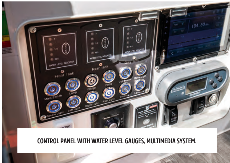
CONTROL PANEL WITH WATER LEVEL GAUGES, MULTIMEDIA SYSTEM.