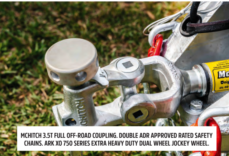
MCHITCH 3.5T FULL OFF-ROAD COUPLING. DOUBLE ADR APPROVED RATED SAFETY CHAINS. ARK X0 750 SERIES EXTRA HEAVY DUTY DUAL WHEEL JOCKEY WHEEL.