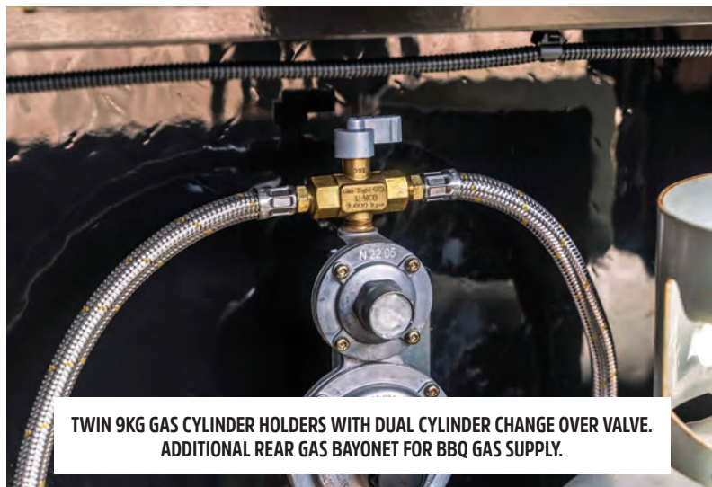
TWIN 9KG GAS CYLINDER HOLDERS WITH DUAL CYLINDER CHANGE OVER VALVE. ADDITIONAL REAR GAS BAYONET FOR BBQ GAS SUPPLY.