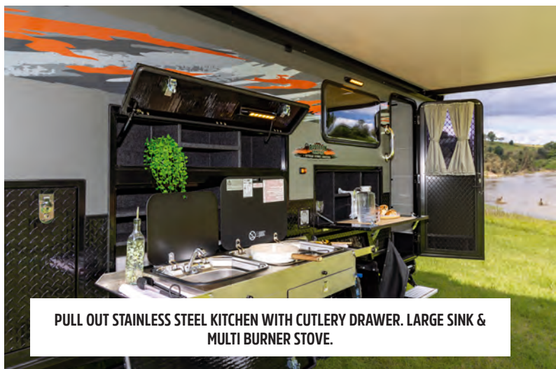
PULL OUT STAINLESS STEEL KITCHEN WITH CUTLERY DRAWER. LARGE SINK & MULTI BURNER STOVE.