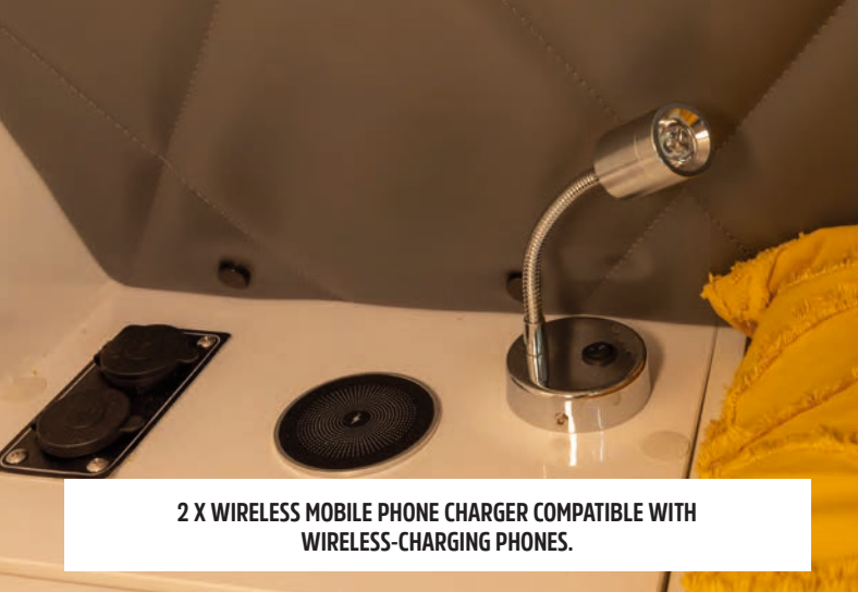
2 X WIRELESS MOBILE PHONE CHARGER COMPATIBLE WITH WIRELESS-CHARGING PHONES.