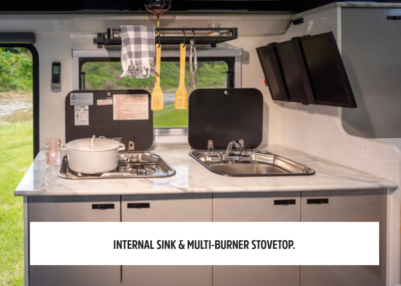
INTERNAL SINK & MULTI-BURNER STOVETOP.