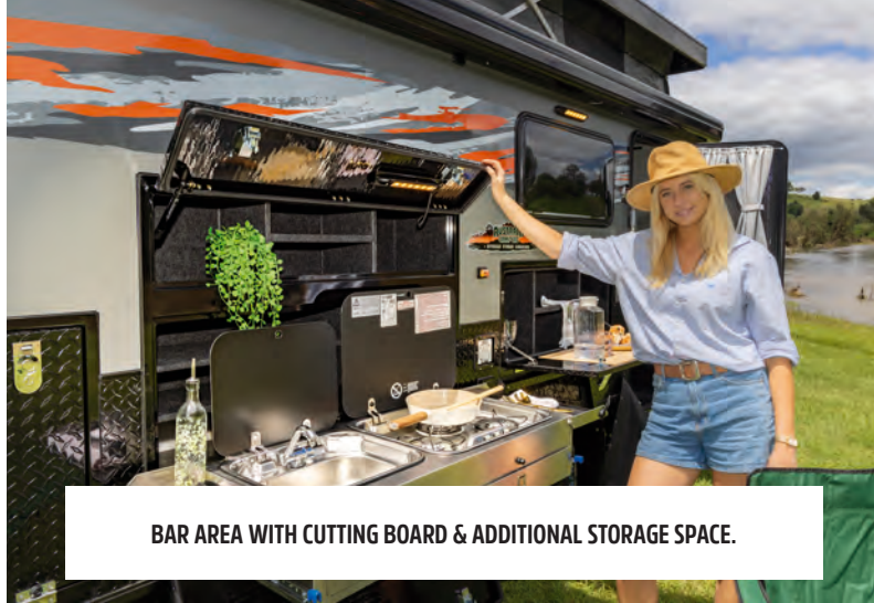
BAR AREA WITH CUTTING BOARD & ADDITIONAL STORAGE SPACE.