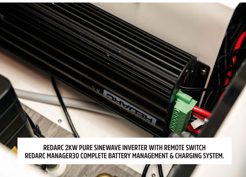
REDARC 2KW PURE SINEWAVE INVERTER WITH REMOTE SWITCH REDARC MANAGER30 COMPLETE BATTERY MANAGEMENT & CHARGING SYSTEM.