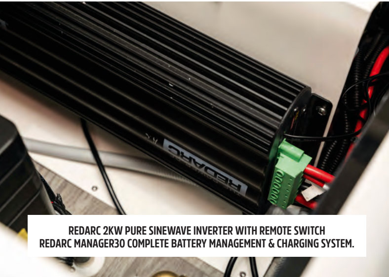
REDARC 2KW PURE SINEWAVE INVERTER WITH REMOTE SWITCH REDARC MANAGER30 COMPLETE BATTERY MANAGEMENT & CHARGING SYSTEM.