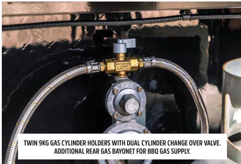
TWIN 9KG GAS CYLINDER HOLDERS WITH DUAL CYLINDER CHANGE OVER VALVE. ADDITIONAL REAR GAS BAYONET FOR BBQ GAS SUPPLY.