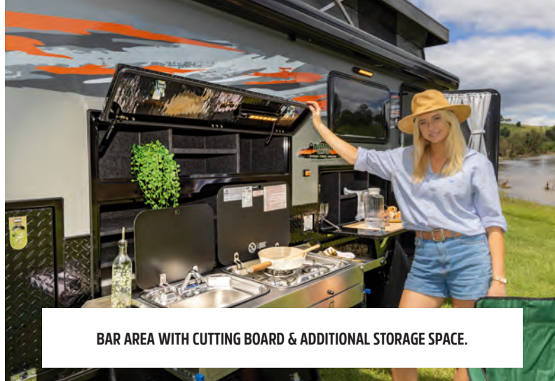
BAR AREA WITH CUTTING BOARD & ADDITIONAL STORAGE SPACE.