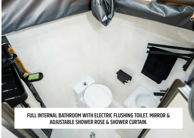
FULL INTERNAL BATHROOM WITH ELECTRIC FLUSHING TOILET. MIRROR & ADJUSTABLE SHOWER ROSE & SHOWER CURTAIN.