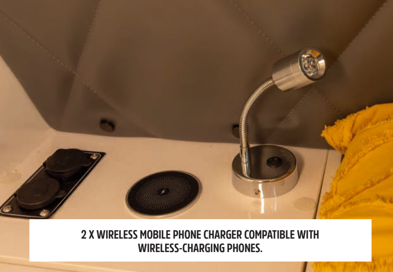
2 X WIRELESS MOBILE PHONE CHARGER COMPATIBLE WITH WIRELESS-CHARGING PHONES.