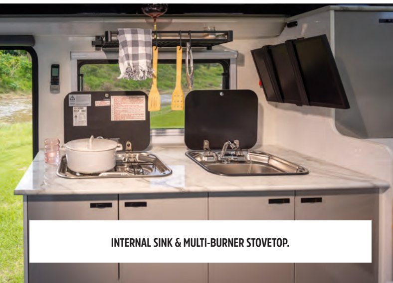
INTERNAL SINK & MULTI-BURNER STOVETOP.