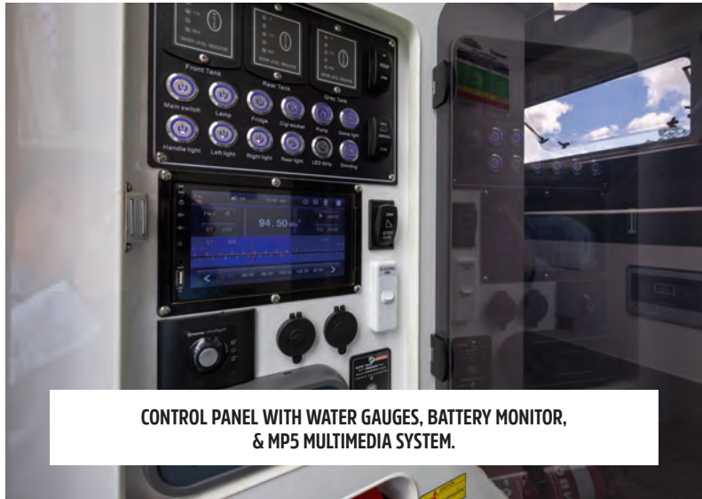
CONTROL PANEL WITH WATER GAUGES, BATTERY MONITOR, & MP5 MULTIMEDIA SYSTEM.