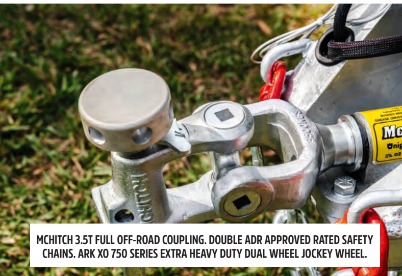
MCHITCH 3.5T FULL OFF-ROAD COUPLING. DOUBLE ADR APPROVED RATED SAFETY CHAINS. ARK X0 750 SERIES EXTRA HEAVY DUTY DUAL WHEEL JOCKEY WHEEL.