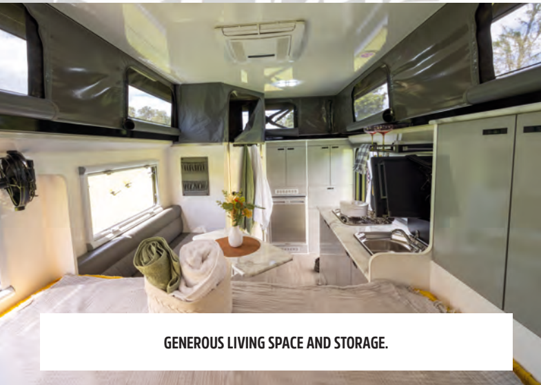
GENEROUS LIVING SPACE AND STORAGE.