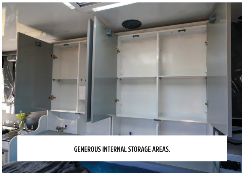
GENEROUS INTERNAL STORAGE AREAS.