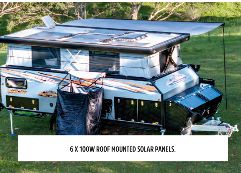
6 X 100W ROOF MOUNTED SOLAR PANELS.