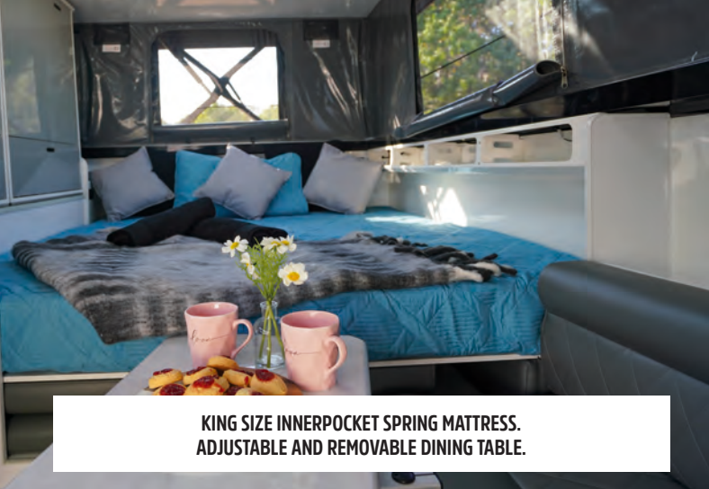
KING SIZE INNERPOCKET SPRING MATTRESS. ADJUSTABLE AND REMOVABLE DINING TABLE.