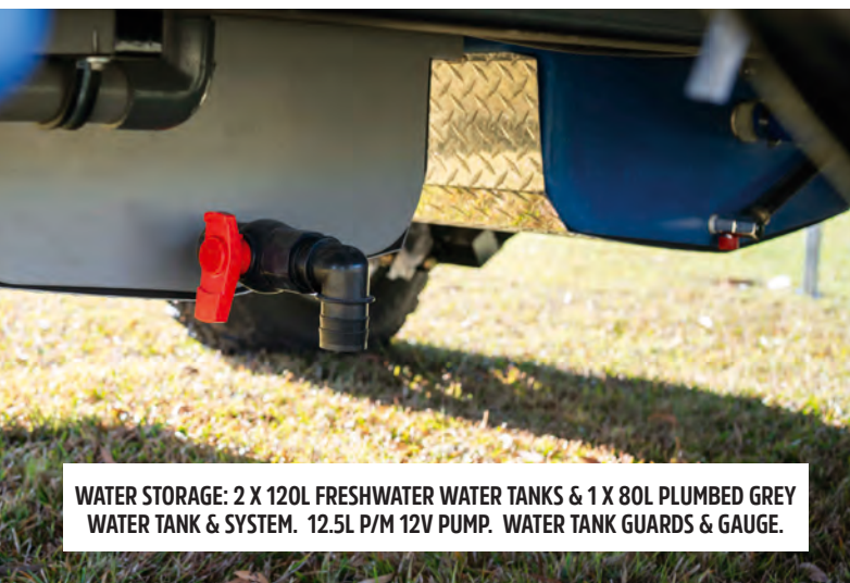
WATER STORAGE: 2 X 120L FRESHWATER WATER TANKS & 1 X 80L PLUMBED GREY WATER TANK & SYSTEM. 12.5L P/M 12V PUMP. WATER TANK GUARDS & GAUGE.