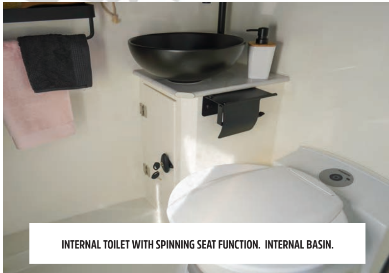
INTERNAL TOILET WITH SPINNING SEAT FUNCTION. INTERNAL BASIN.