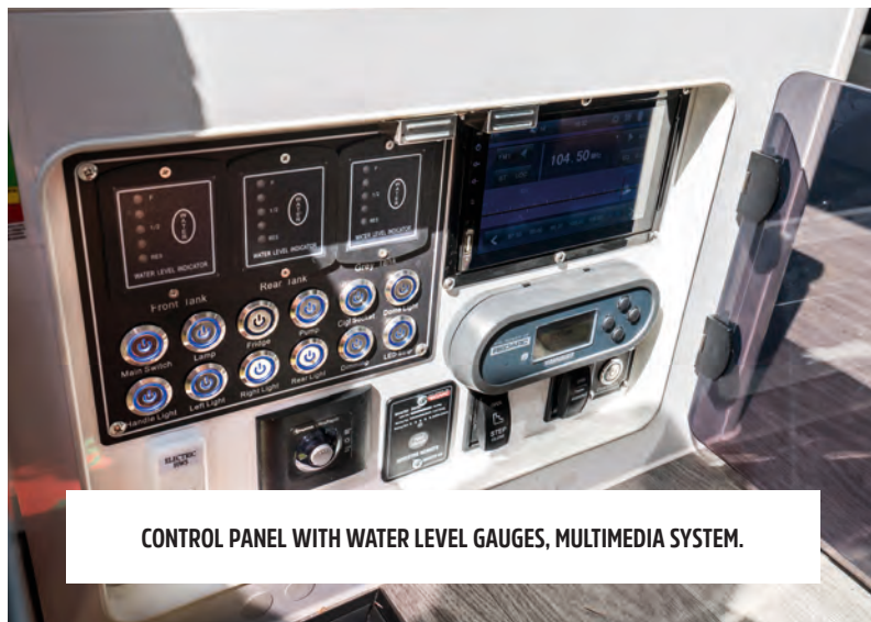
CONTROL PANEL WITH WATER LEVEL GAUGES, MULTIMEDIA SYSTEM.