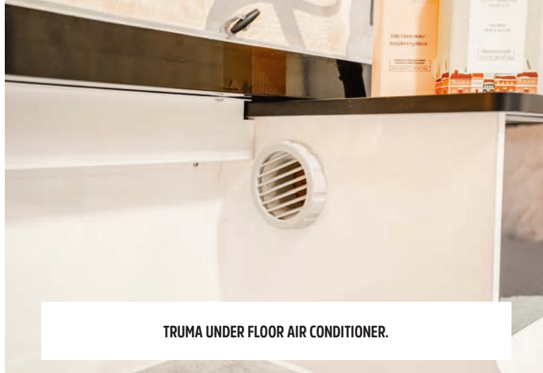
TRUMA UNDER FLOOR AIR CONDITIONER.