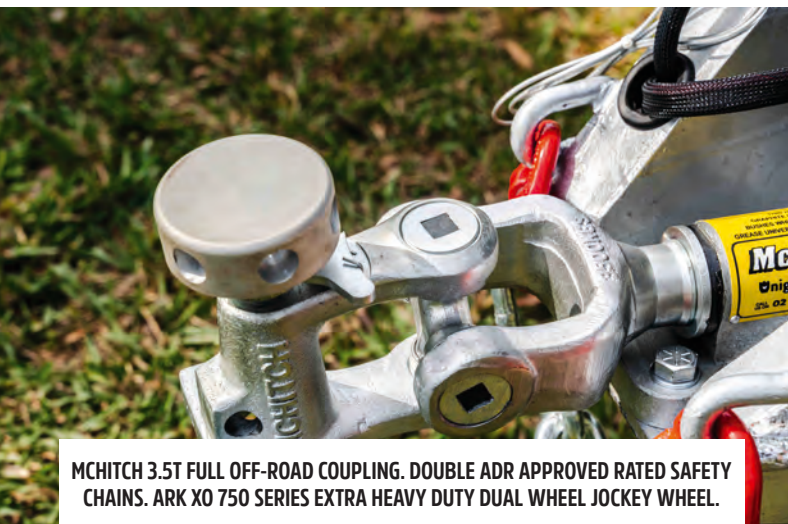
MCHITCH 3.5T FULL OFF-ROAD COUPLING. DOUBLE ADR APPROVED RATED SAFETY CHAINS. ARK XO 750 SERIES EXTRA HEAVY DUTY DUAL WHEEL JOCKEY WHEEL.