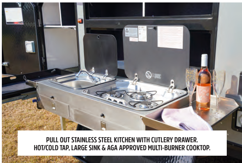
PULL OUT STAINLESS STEEL KITCHEN WITH CUTLERY DRAWER. HOT/COLD TAP, LARGE SINK & AGA APPROVED MULTI-BURNER COOKTOP.