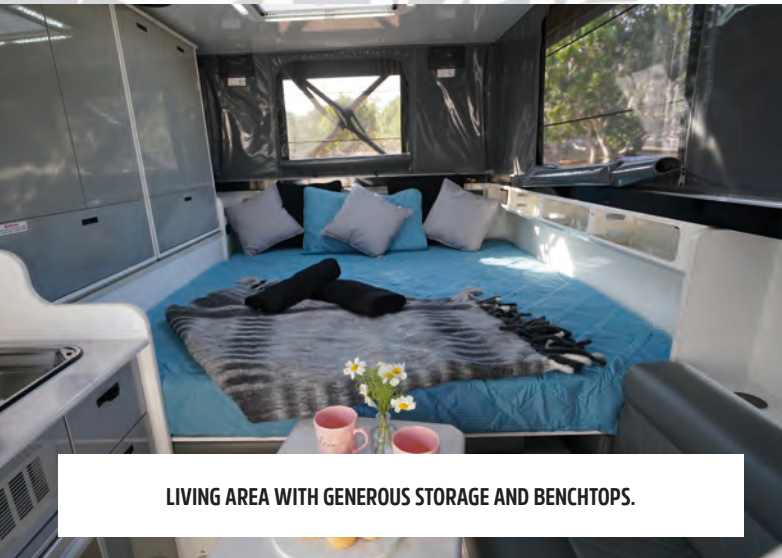
LIVING AREA WITH GENEROUS STORAGE AND BENCHTOPS.