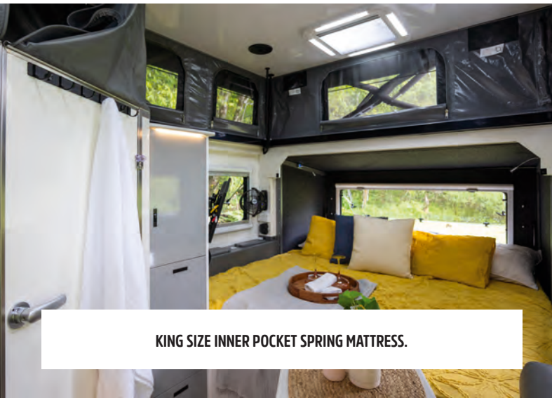
KING SIZE INNER POCKET SPRING MATTRESS.