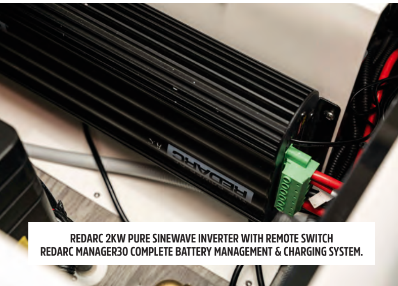
REDARC 2KW PURE SINEWAVE INVERTER WITH REMOTE SWITCH REDARC MANAGER30 COMPLETE BATTERY MANAGEMENT & CHARGING SYSTEM.