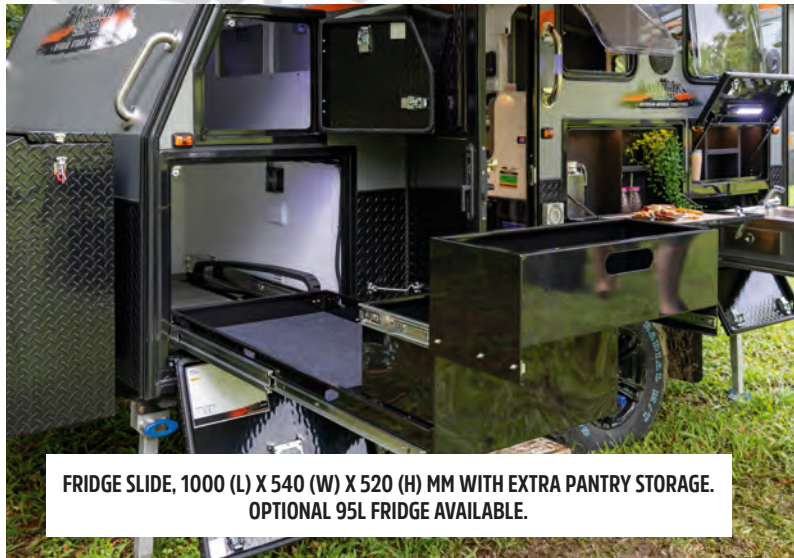
FRIDGE SLIDE, 1000 (L) X 540 (W) X 520 (H) MM WITH EXTRA PANTRY STORAGE. OPTIONAL 95L FRIDGE AVAILABLE.