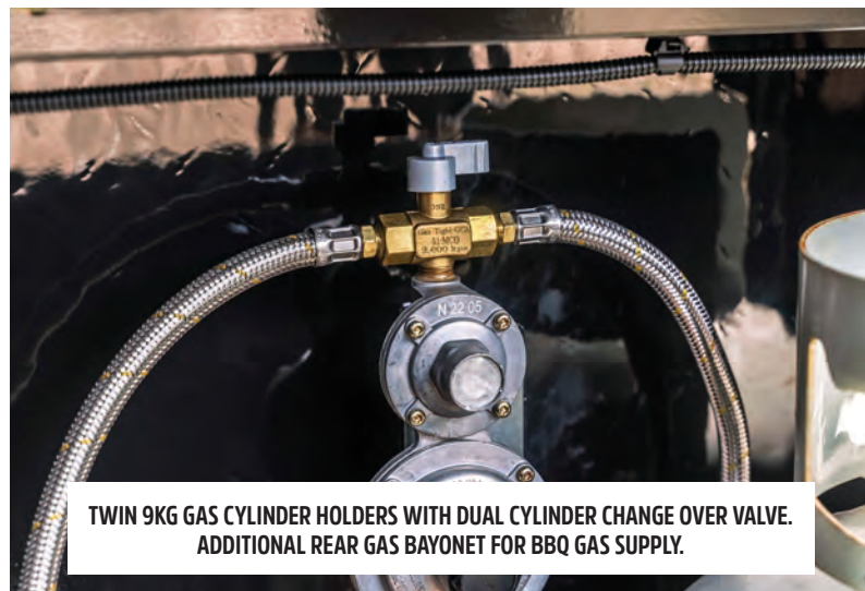
TWIN 9KG GAS CYLINDER HOLDERS WITH DUAL CYLINDER CHANGE OVER VALVE. ADDITIONAL REAR GAS BAYONET FOR BBQ GAS SUPPLY.