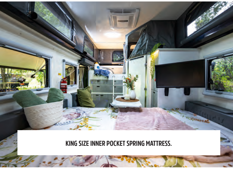
KING SIZE INNER POCKET SPRING MATTRESS.