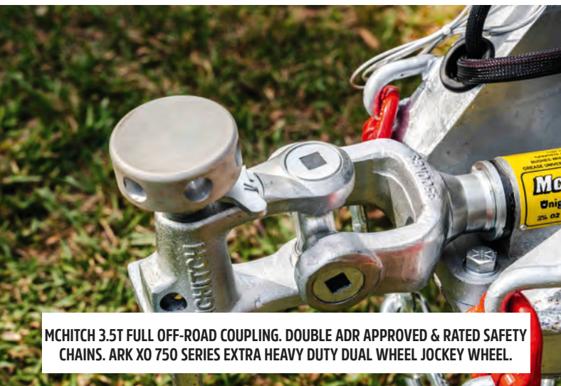
MCHITCH 3.5T FULL OFF-ROAD COUPLING. DOUBLE ADR APPROVED & RATED SAFETY CHAINS. ARK XO 750 SERIES EXTRA HEAVY DUTY DUAL WHEEL JOCKEY WHEEL.