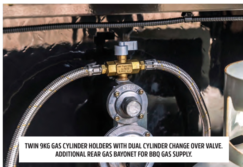
TWIN 9KG GAS CYLINDER HOLDERS WITH DUAL CYLINDER CHANGE OVER VALVE. ADDITIONAL REAR GAS BAYONET FOR BBQ GAS SUPPLY.