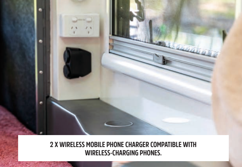
2 X WIRELESS MOBILE PHONE CHARGER COMPATIBLE WITH WIRELESS-CHARGING PHONES.