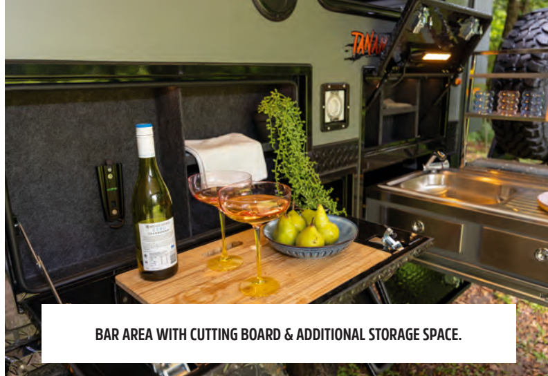
BAR AREA WITH CUTTING BOARD & ADDITIONAL STORAGE SPACE.