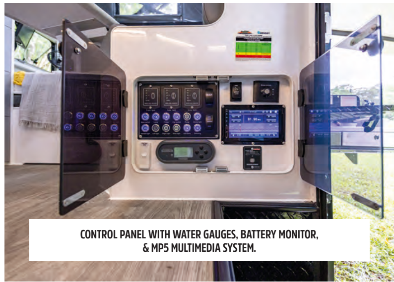
CONTROL PANEL WITH WATER GAUGES, BATTERY MONITOR, & MP5 MULTIMEDIA SYSTEM.