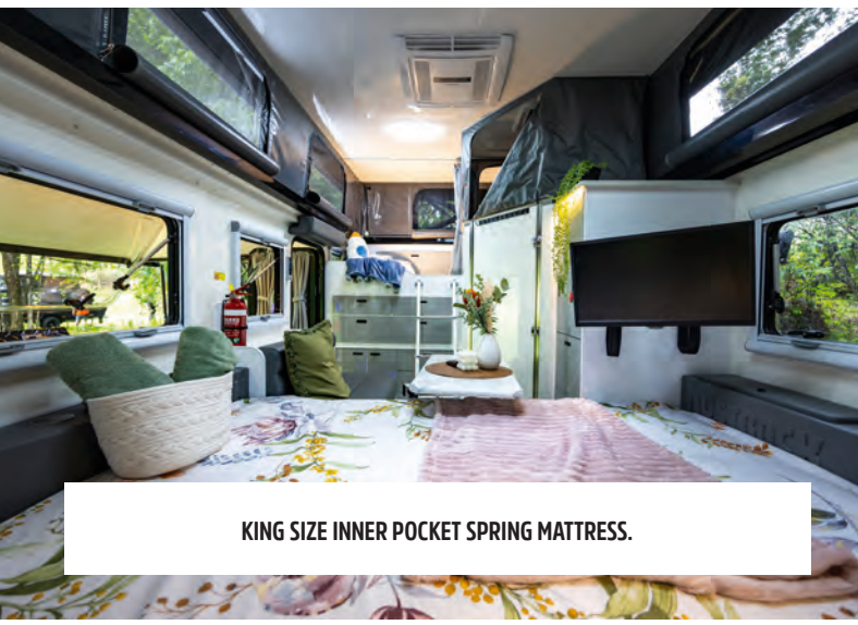
KING SIZE INNER POCKET SPRING MATTRESS.