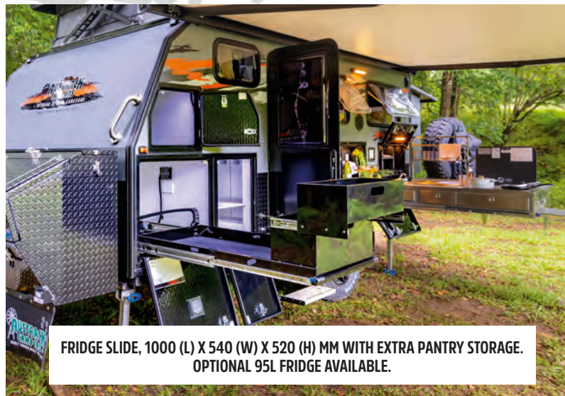
FRIDGE SLIDE, 1000 (L) X 540 (W) X 520 (H) MM WITH EXTRA PANTRY STORAGE. OPTIONAL 95L FRIDGE AVAILABLE.