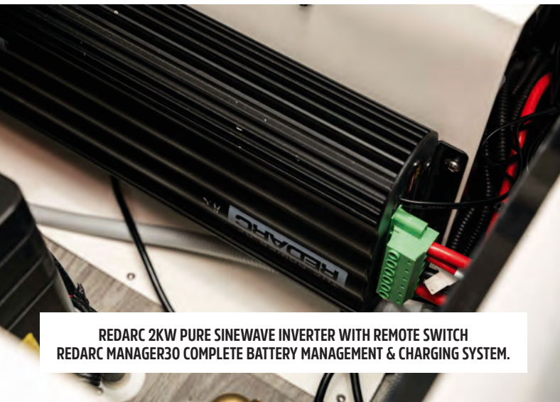
REDARC 2KW PURE SINEWAVE INVERTER WITH REMOTE SWITCH REDARC MANAGER30 COMPLETE BATTERY MANAGEMENT & CHARGING SYSTEM.