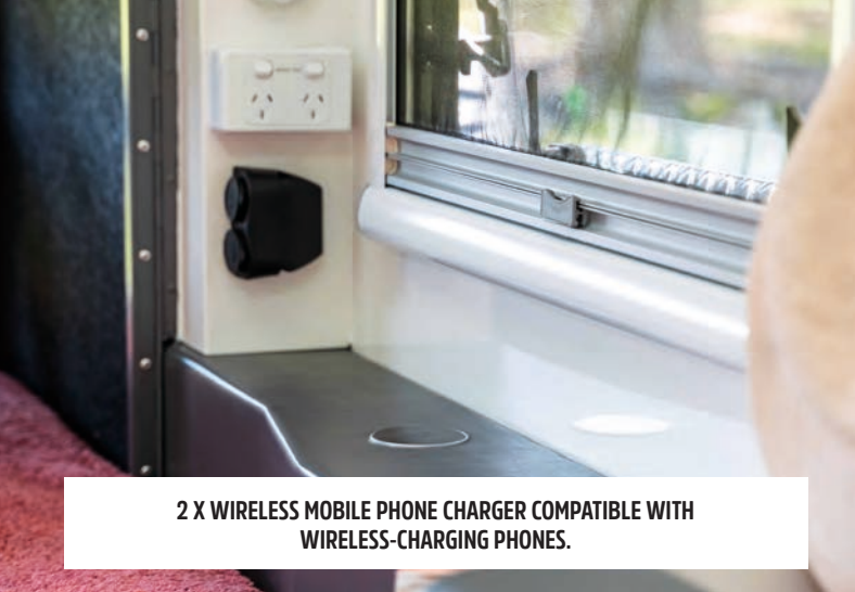
2 X WIRELESS MOBILE PHONE CHARGER COMPATIBLE WITH WIRELESS-CHARGING PHONES.