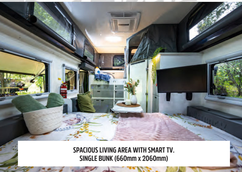
SPACIOUS LIVING AREA WITH SMART TV. SINGLE BUNK (660mm x 2060mm)