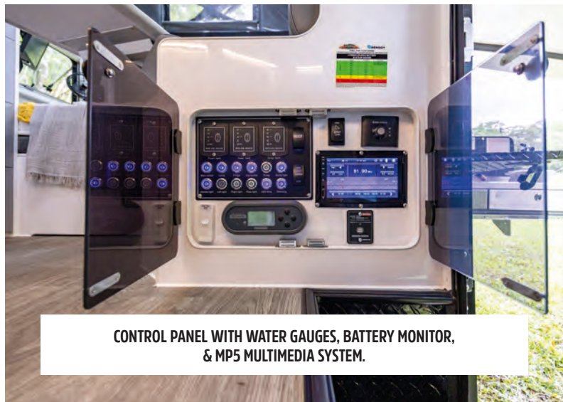
CONTROL PANEL WITH WATER GAUGES, BATTERY MONITOR, & MP5 MULTIMEDIA SYSTEM.