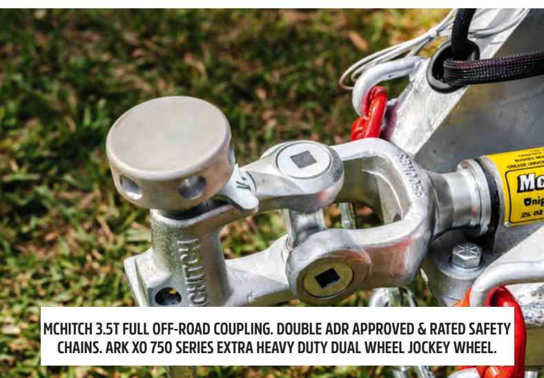
MCHITCH 3.5T FULL OFF-ROAD COUPLING. DOUBLE ADR APPROVED & RATED SAFETY CHAINS. ARK XO 750 SERIES EXTRA HEAVY DUTY DUAL WHEEL JOCKEY WHEEL.