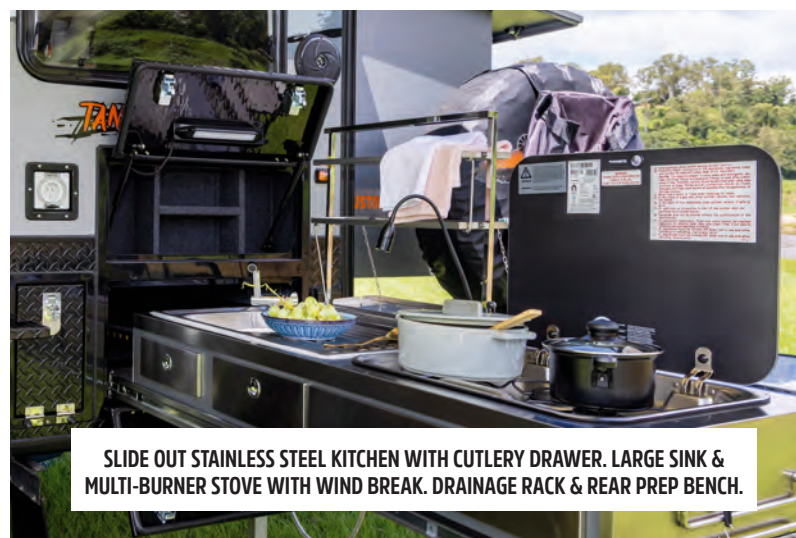
SLIDE OUT STAINLESS STEEL KITCHEN WITH CUTLERY DRAWER. LARGE SINK & MULTI-BURNER STOVE WITH WIND BREAK. DRAINAGE RACK & REAR PREP BENCH.