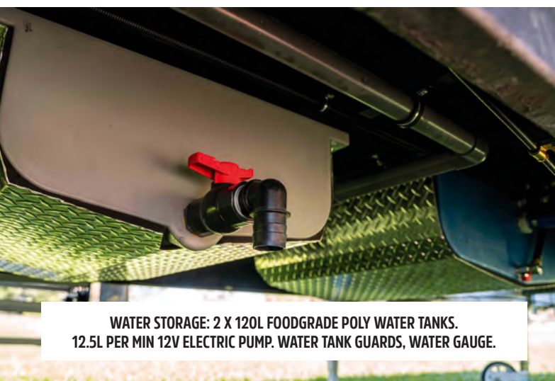
WATER STORAGE: 2 X 120L FOODGRADE POLY WATER TANKS. 12.5L PER MIN 12V ELECTRIC PUMP. WATER TANK GUARDS, WATER GAUGE.