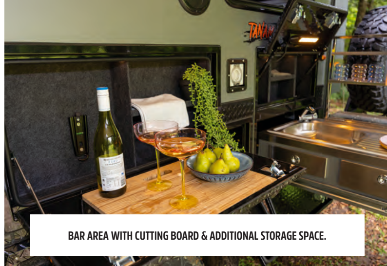
BAR AREA WITH CUTTING BOARD & ADDITIONAL STORAGE SPACE.