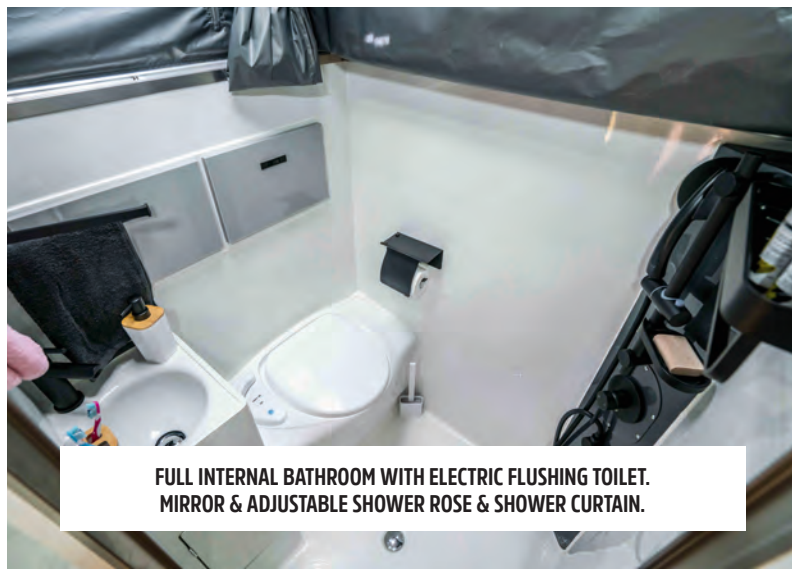
FULL INTERNAL BATHROOM WITH ELECTRIC FLUSHING TOILET. MIRROR & ADJUSTABLE SHOWER ROSE & SHOWER CURTAIN.