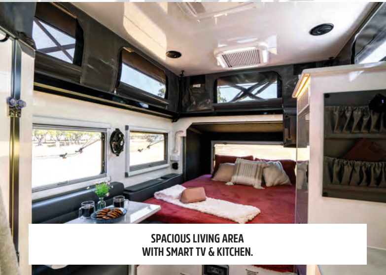
SPACIOUS LIVING AREA WITH SMART TV & KITCHEN.