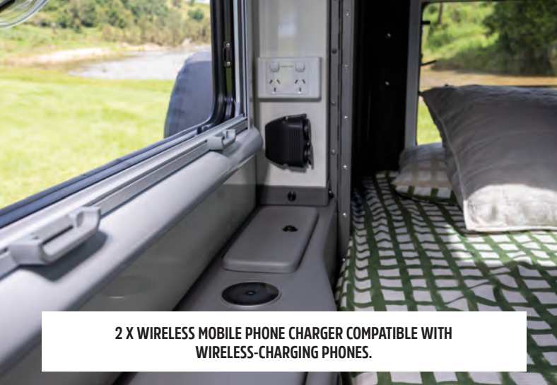
2 X WIRELESS MOBILE PHONE CHARGER COMPATIBLE WITH WIRELESS-CHARGING PHONES.