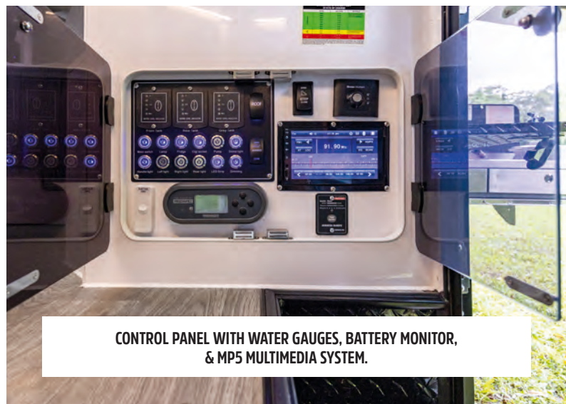
CONTROL PANEL WITH WATER GAUGES, BATTERY MONITOR, & MP5 MULTIMEDIA SYSTEM.