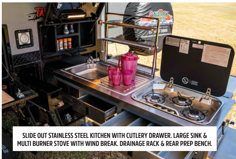
SLIDE OUT STAINLESS STEEL KITCHEN WITH CUTLERY DRAWER. LARGE SINK & MULTI BURNER STOVE WITH WIND BREAK. DRAINAGE RACK & REAR PREP BENCH.