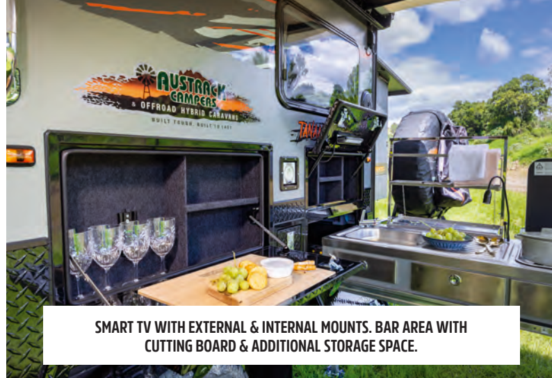
SMART TV WITH EXTERNAL & INTERNAL MOUNTS. BAR AREA WITH CUTTING BOARD & ADDITIONAL STORAGE SPACE.