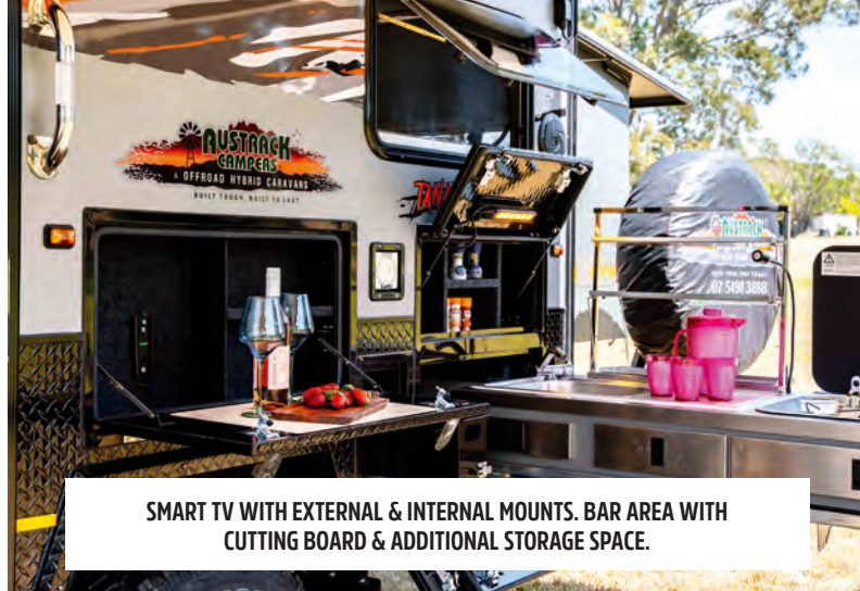
SMART TV WITH EXTERNAL & INTERNAL MOUNTS. BAR AREA WITH CUTTING BOARD & ADDITIONAL STORAGE SPACE.