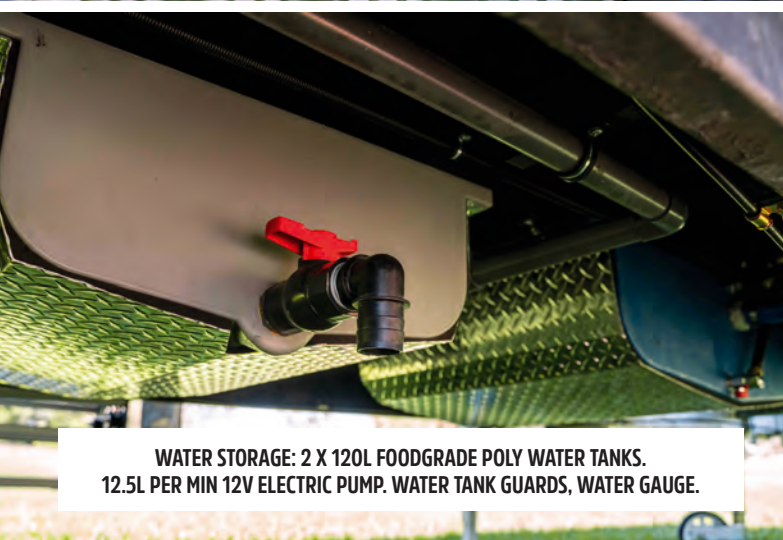
WATER STORAGE: 2 X 120L FOODGRADE POLY WATER TANKS. 12.5L PER MIN 12V ELECTRIC PUMP. WATER TANK GUARDS, WATER GAUGE.