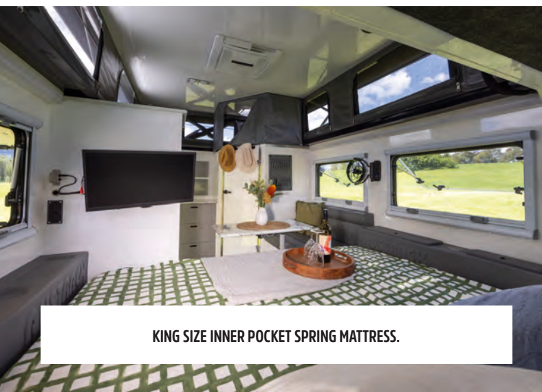
KING SIZE INNER POCKET SPRING MATTRESS.