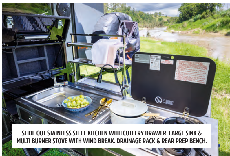
SLIDE OUT STAINLESS STEEL KITCHEN WITH CUTLERY DRAWER. LARGE SINK & MULTI BURNER STOVE WITH WIND BREAK. DRAINAGE RACK & REAR PREP BENCH.