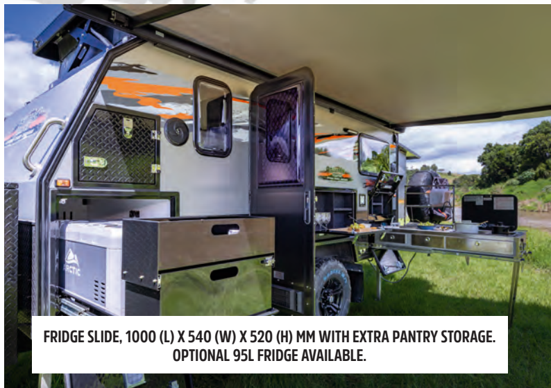
FRIDGE SLIDE, 1000 (L) X 540 (W) X 520 (H) MM WITH EXTRA PANTRY STORAGE. OPTIONAL 95L FRIDGE AVAILABLE.