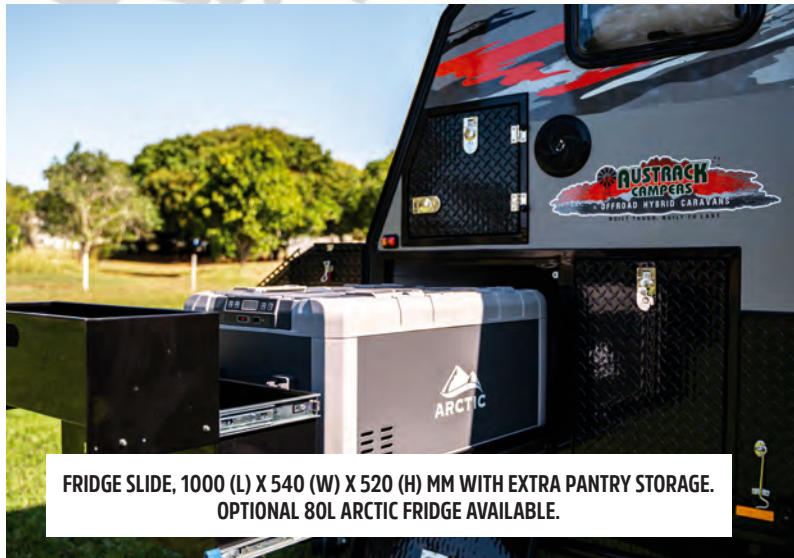
FRIDGE SLIDE, 1000 (L) X 540 (W) X 520 (H) MM WITH EXTRA PANTRY STORAGE. OPTIONAL 80L ARCTIC FRIDGE AVAILABLE.