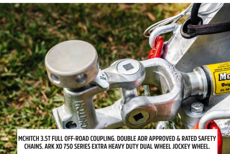
MCHITCH 3.5T FULL OFF-ROAD COUPLING. DOUBLE ADR APPROVED & RATED SAFETY CHAINS. ARK X0 750 SERIES EXTRA HEAVY DUTY DUAL WHEEL JOCKEY WHEEL.