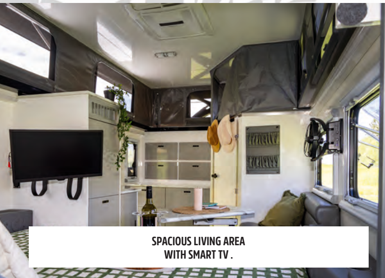
SPACIOUS LIVING AREA WITH SMART TV.