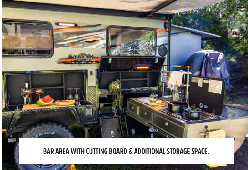
BAR AREA WITH CUTTING BOARD & ADDITIONAL STORAGE SPACE.