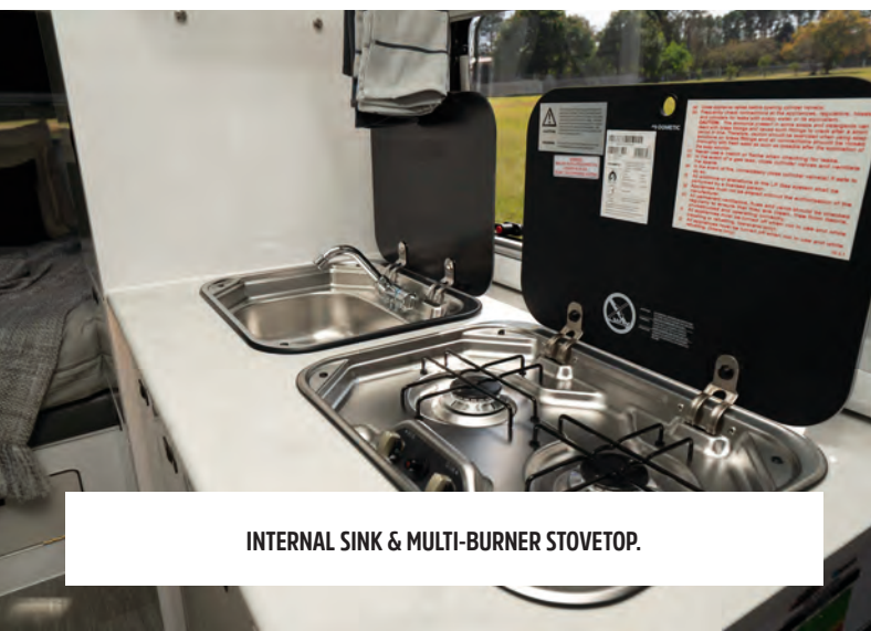
INTERNAL SINK & MULTI-BURNER STOVETOP.