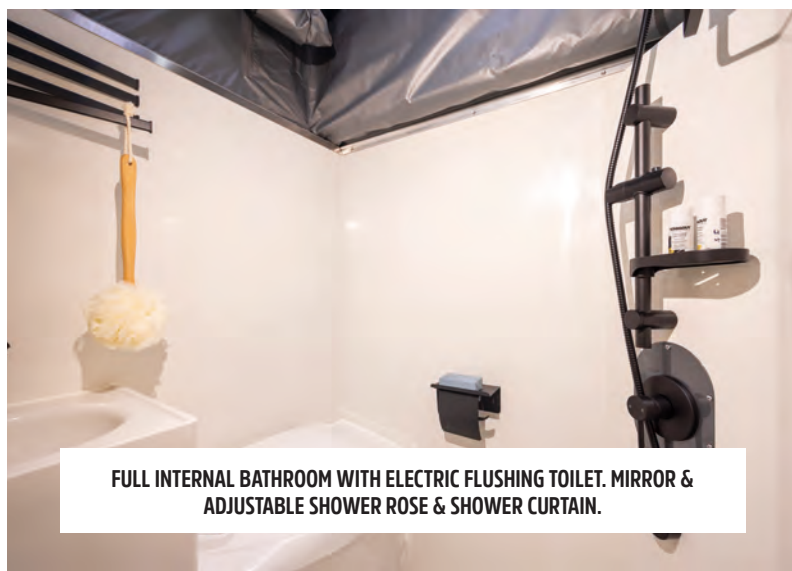
FULL INTERNAL BATHROOM WITH ELECTRIC FLUSHING TOILET. MIRROR & ADJUSTABLE SHOWER ROSE & SHOWER CURTAIN.