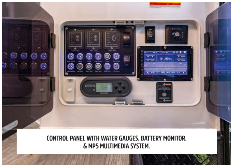
CONTROL PANEL WITH WATER GAUGES, BATTERY MONITOR, & MP5 MULTIMEDIA SYSTEM.