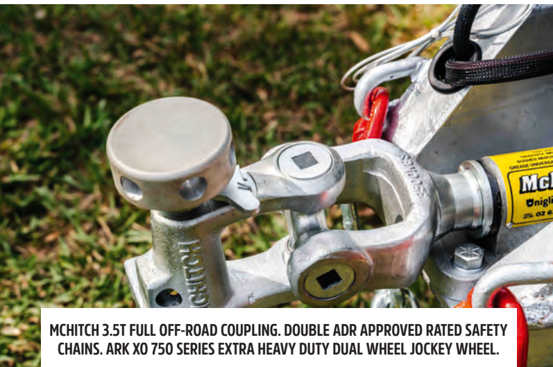
MCHITCH 3.5T FULL OFF-ROAD COUPLING. DOUBLE ADR APPROVED RATED SAFETY CHAINS. ARK X0 750 SERIES EXTRA HEAVY DUTY DUAL WHEEL JOCKEY WHEEL.