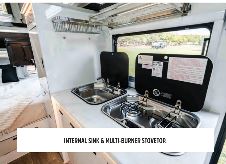
INTERNAL SINK & MULTI-BURNER STOVETOP.