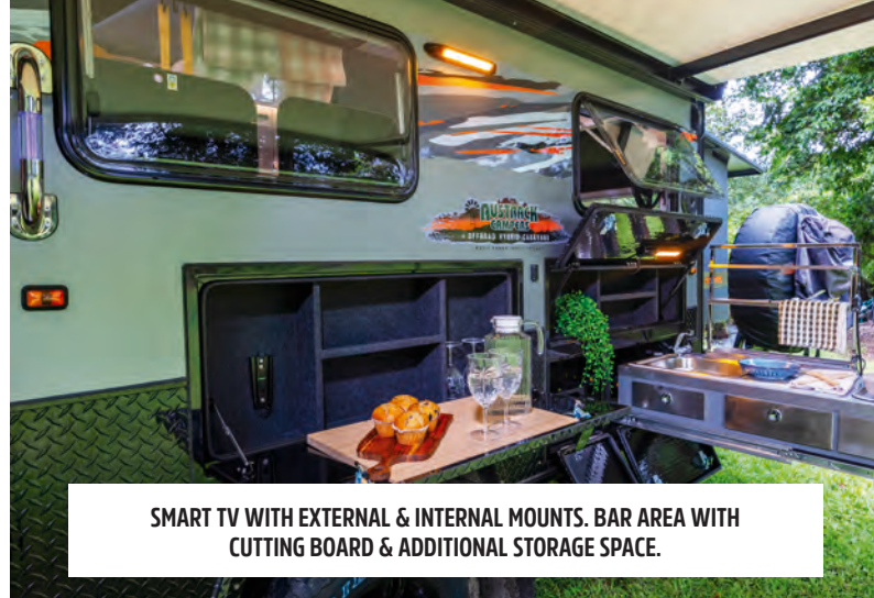
SMART TV WITH EXTERNAL & INTERNAL MOUNTS. BAR AREA WITH CUTTING BOARD & ADDITIONAL STORAGE SPACE.