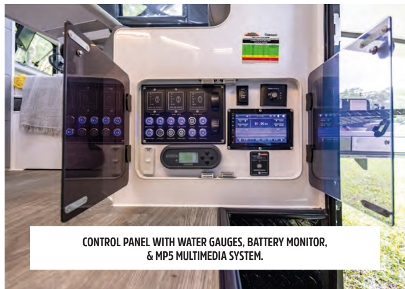
CONTROL PANEL WITH WATER GAUGES, BATTERY MONITOR, & MP5 MULTIMEDIA SYSTEM.