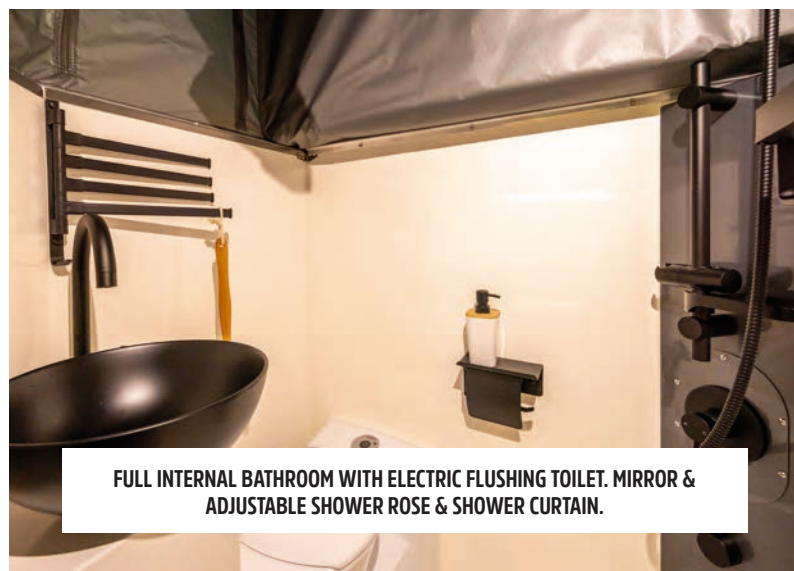
FULL INTERNAL BATHROOM WITH ELECTRIC FLUSHING TOILET. MIRROR & ADJUSTABLE SHOWER ROSE & SHOWER CURTAIN.