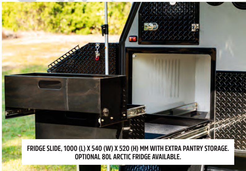
FRIDGE SLIDE, 1000 (L) X 540 (W) X 520 (H) MM WITH EXTRA PANTRY STORAGE. OPTIONAL 80L ARCTIC FRIDGE AVAILABLE.