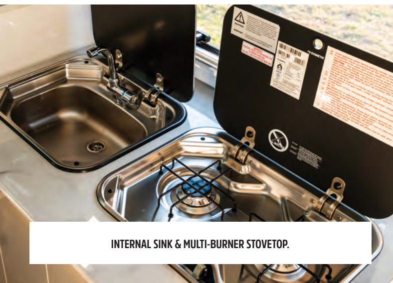
INTERNAL SINK & MULTI-BURNER STOVETOP.