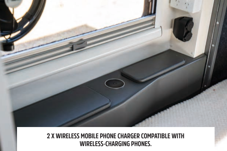
2 X WIRELESS MOBILE PHONE CHARGER COMPATIBLE WITH WIRELESS-CHARGING PHONES.