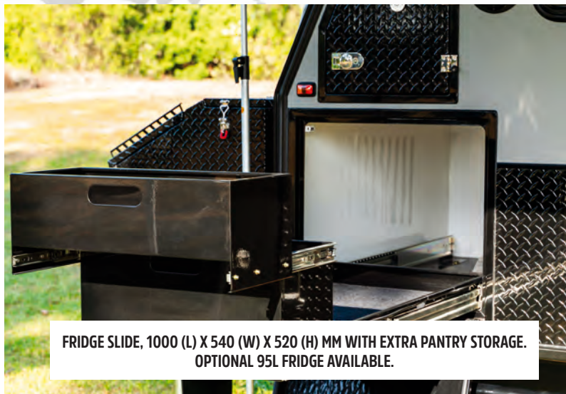
FRIDGE SLIDE, 1000 (L) X 540 (W) X 520 (H) MM WITH EXTRA PANTRY STORAGE. OPTIONAL 95L FRIDGE AVAILABLE.