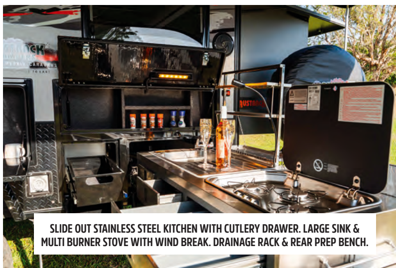
SLIDE OUT STAINLESS STEEL KITCHEN WITH CUTLERY DRAWER. LARGE SINK & MULTI BURNER STOVE WITH WIND BREAK. DRAINAGE RACK & REAR PREP BENCH.