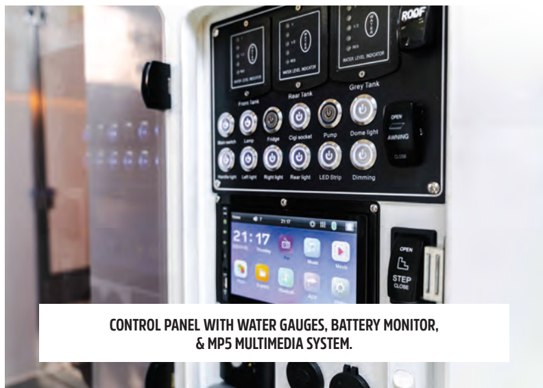
CONTROL PANEL WITH WATER GAUGES, BATTERY MONITOR, & MP5 MULTIMEDIA SYSTEM.