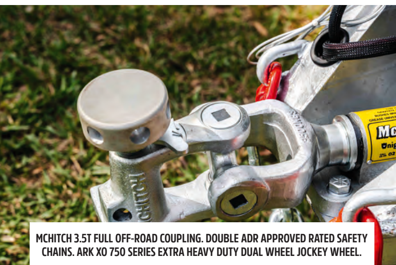
MCHITCH 3.5T FULL OFF-ROAD COUPLING. DOUBLE ADR APPROVED RATED SAFETY CHAINS. ARK X0 750 SERIES EXTRA HEAVY DUTY DUAL WHEEL JOCKEY WHEEL.