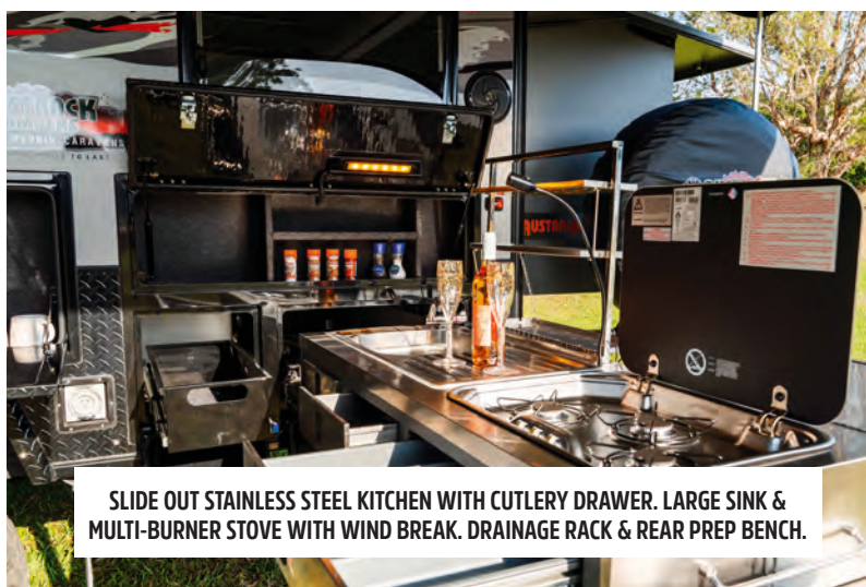
SLIDE OUT STAINLESS STEEL KITCHEN WITH CUTLERY DRAWER. LARGE SINK & MULTI-BURNER STOVE WITH WIND BREAK. DRAINAGE RACK & REAR PREP BENCH.