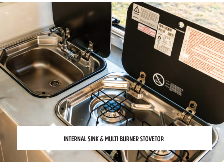
INTERNAL SINK & MULTI BURNER STOVETOP.