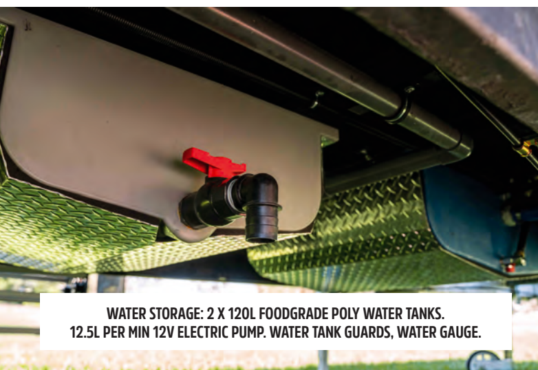
WATER STORAGE: 2 X 120L FOODGRADE POLY WATER TANKS. 12.5L PER MIN 12V ELECTRIC PUMP. WATER TANK GUARDS, WATER GAUGE.