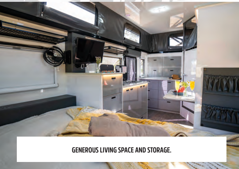
GENEROUS LIVING SPACE AND STORAGE.