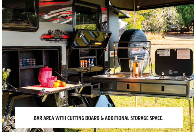
BAR AREA WITH CUTTING BOARD & ADDITIONAL STORAGE SPACE.