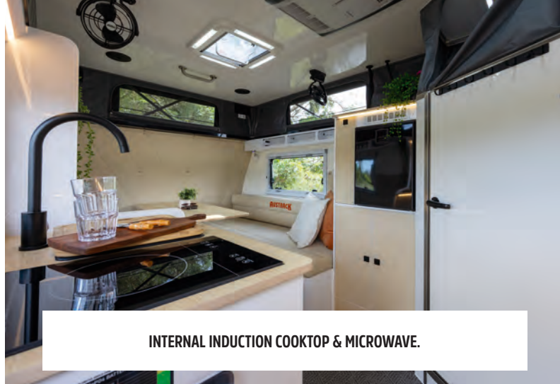
INTERNAL INDUCTION COOKTOP & MICROWAVE.