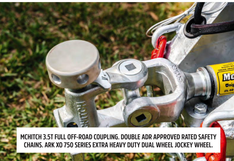
MCHITCH 3.5T FULL OFF-ROAD COUPLING. DOUBLE ADR APPROVED RATED SAFETY CHAINS. ARK XO 750 SERIES EXTRA HEAVY DUTY DUAL WHEEL JOCKEY WHEEL.