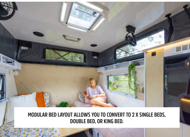
MODULAR BED LAYOUT ALLOWS YOU TO CONVERT TO 2 X SINGLE BEDS, DOUBLE BED, OR KING BED.