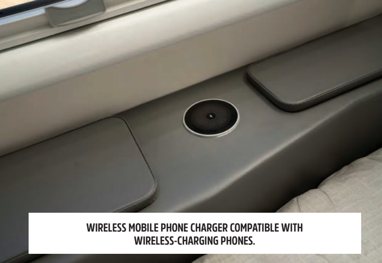
WIRELESS MOBILE PHONE CHARGER COMPATIBLE WITH WIRELESS-CHARGING PHONES.