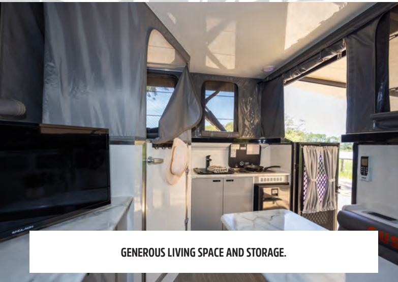
GENEROUS LIVING SPACE AND STORAGE.