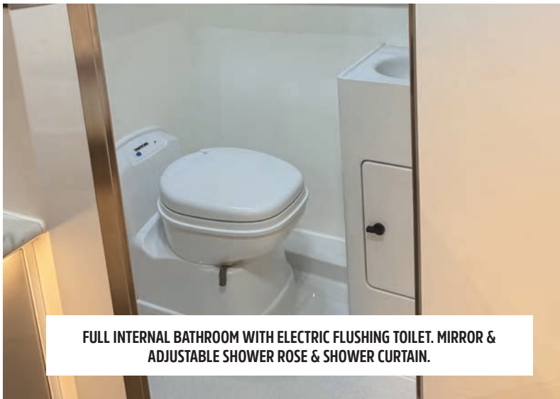
FULL INTERNAL BATHROOM WITH ELECTRIC FLUSHING TOILET. MIRROR & ADJUSTABLE SHOWER ROSE & SHOWER CURTAIN.