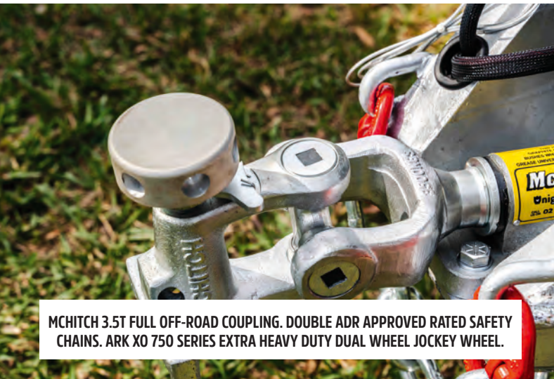
MCHITCH 3.5T FULL OFF-ROAD COUPLING. DOUBLE ADR APPROVED RATED SAFETY CHAINS. ARK XO 750 SERIES EXTRA HEAVY DUTY DUAL WHEEL JOCKEY WHEEL.