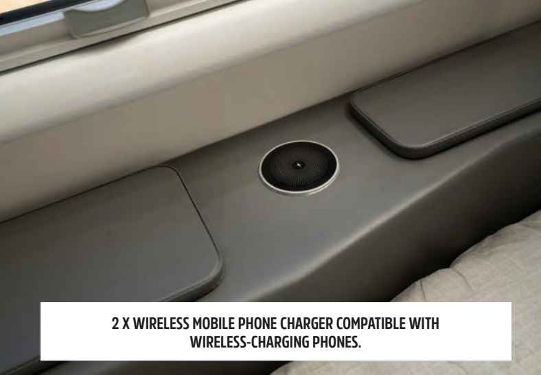
2 X WIRELESS MOBILE PHONE CHARGER COMPATIBLE WITH WIRELESS-CHARGING PHONES.