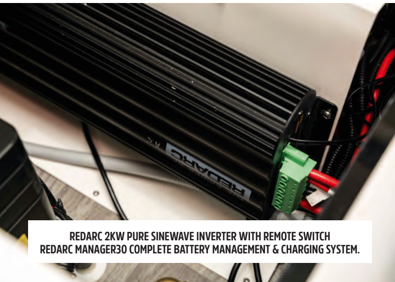
REDARC 2KW PURE SINEWAVE INVERTER WITH REMOTE SWITCH REDARC MANAGER30 COMPLETE BATTERY MANAGEMENT & CHARGING SYSTEM.