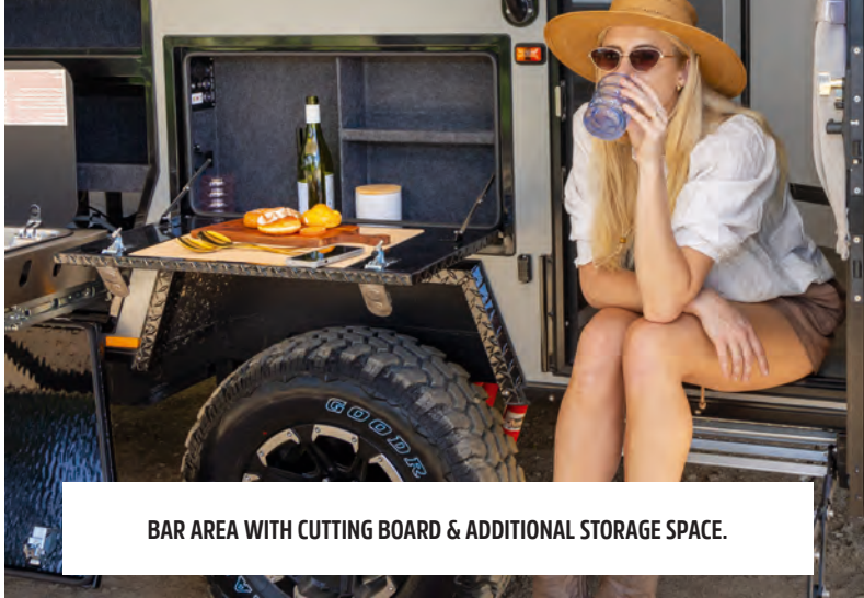
BAR AREA WITH CUTTING BOARD & ADDITIONAL STORAGE SPACE.