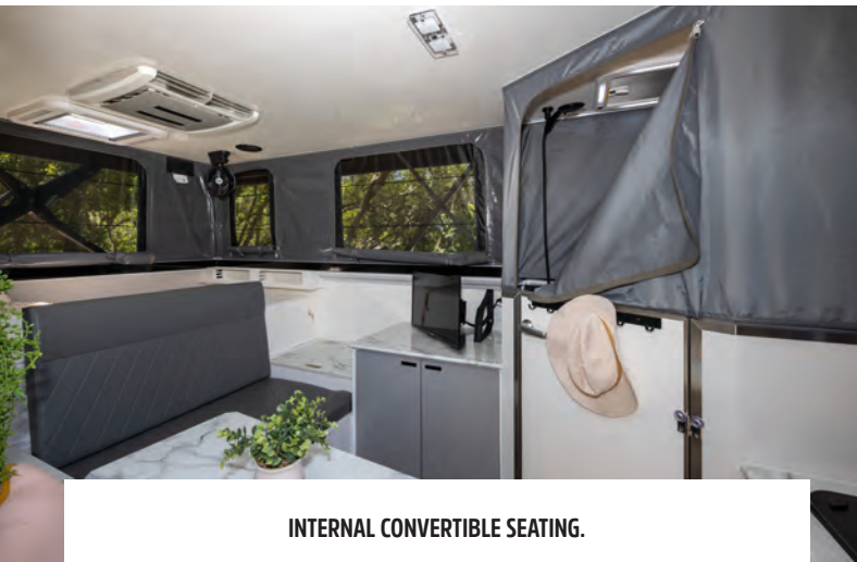
INTERNAL CONVERTIBLE SEATING.