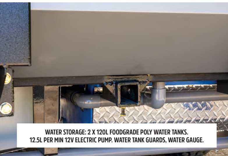
WATER STORAGE: 2 X 120L FOODGRADE POLY WATER TANKS. 12.5L PER MIN 12V ELECTRIC PUMP. WATER TANK GUARDS, WATER GAUGE.