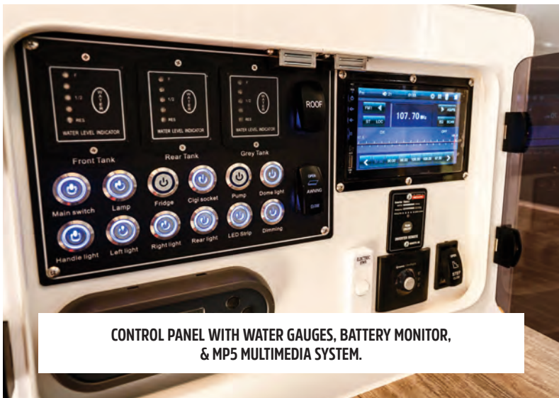
CONTROL PANEL WITH WATER GAUGES, BATTERY MONITOR, & MP5 MULTIMEDIA SYSTEM.