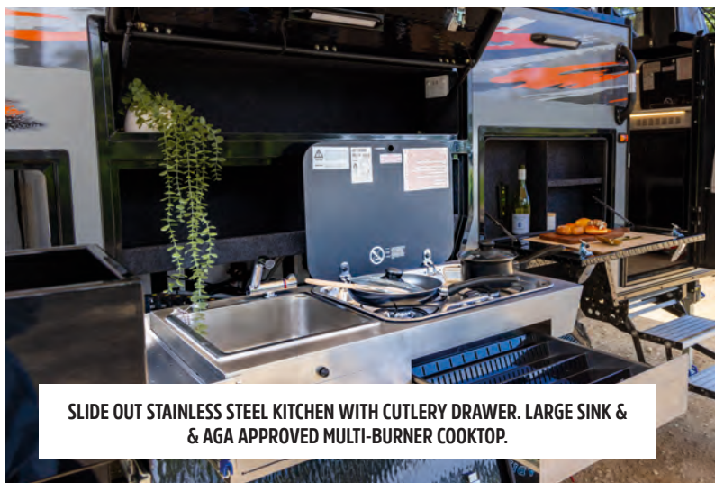
SLIDE OUT STAINLESS STEEL KITCHEN WITH CUTLERY DRAWER. LARGE SINK & AGA APPROVED MULTI-BURNER COOKTOP.