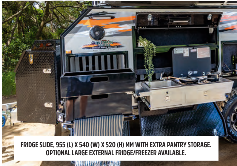
FRIDGE SLIDE, 955 (L) X 540 (W) X 520 (H) MM WITH EXTRA PANTRY STORAGE. OPTIONAL LARGE EXTERNAL FRIDGE/FREEZER AVAILABLE.